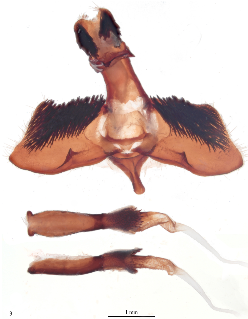
FIGURE 3. Pseudodelta melas holotype, genitalia structure.

Habitat and behaviour. The only specimen was attracted to a sample of various synthetic pheromones. The specimen was netted when it directly approached the bundle of lures in sunny weather after night rain at around 11.00 a.m. on the edge of Zika Forest, Kisubi, one of the last well-preserved remnants of the once extensive Lake Victoria outlier forests on the Entebbe/Lake Victoria Peninsula. These forest pockets are still home to a rich butterfly community (Sáfián pers. obs.) and the type locality is best known for the discovery of Zika virus, which was first isolated from samples collected in Zika Forest (Dick et al. 1952).