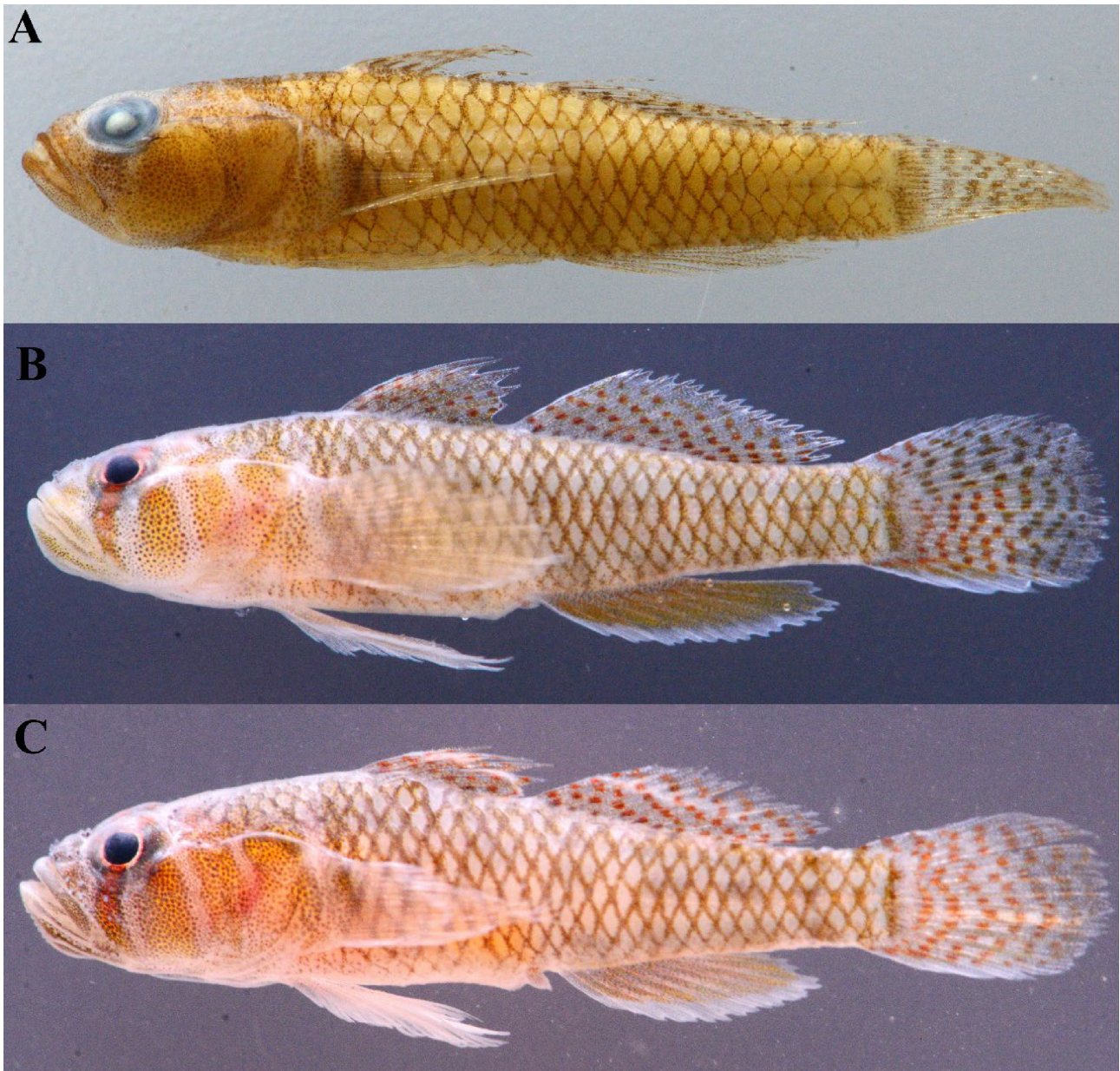
FIGURE 1. (A) Preserved Priolepis formosa sp. nov., holotype, male, NTOUP-2008-04-220, male (19.3 mm SL), Huapingyan, Liociou Township, Pingtung County, Taiwan; (B) freshly collected of paratype, male, NTOUP-2020-07-174, 16.4 mm SL, Dongji Island, WangAn Township, Penghu County, Taiwan; (C) freshly collected of paratype, female, NTOUP-2022-01-034, 15.8 mm SL, Shanhai, Hengchun Township, Pingtung County, Taiwan.

Fins. —D1 VI, D2 I/9–10 (modally 9), A I/7–8 (modally 8), P 17–19 (modally 18), V I/5. Second to fourth spine of D1 equal in length reaching between origin to first ray of D2, when adpressed. D2 all rays branched and last ray always two rays with one branched. A origin located below first ray of D2, all rays branched and last ray always two rays with one branched. One or two uppermost and lowermost rays of P usually unbranched, longest fin ray reaching vertically fourth rays of D2. V no fraenum, full basal membrane; fifth ray branched, 70–95% length of fourth ray; first to fourth rays with two to five branch points and fifth rays branched one or two dichotomous branch points; fourth segmented ray longest reaching only anus. Caudal-fin rounded.