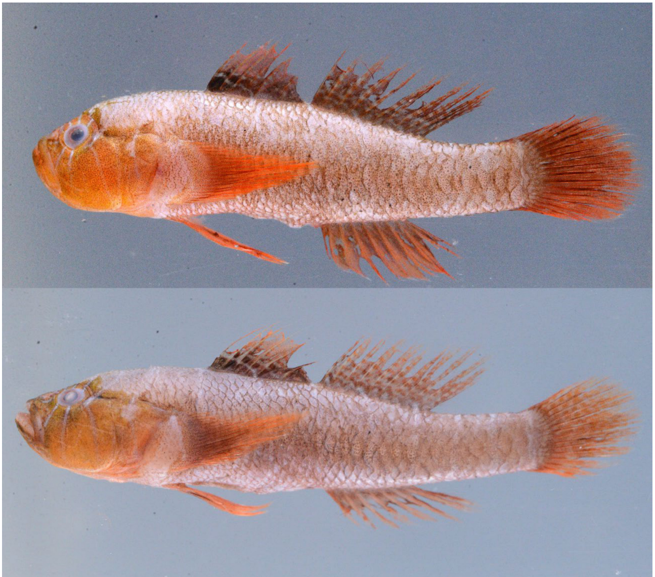
FIGURE 1. Priolepis profunda , upper one, NTOUP-2021-12-181, 36.0 mm SL; lower one, NTOUP-2022-09-111, 33.2 mm SL.