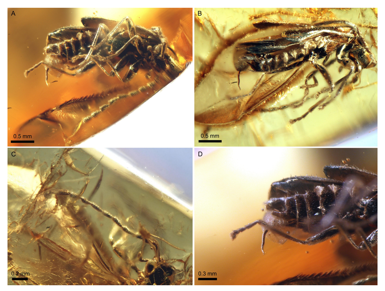
FIGURE 1. Malthodes ( Malthodes ) maximiliani sp. nov. holotype, in Baltic amber. A, ventral view; B, lateral view; C, detail of antenna; D, detail of last abdominal segments (ventro-lateral view).

Type locality. Gdańsk area, Mierzeja Wiślana (Wisła River estuary area), Poland.