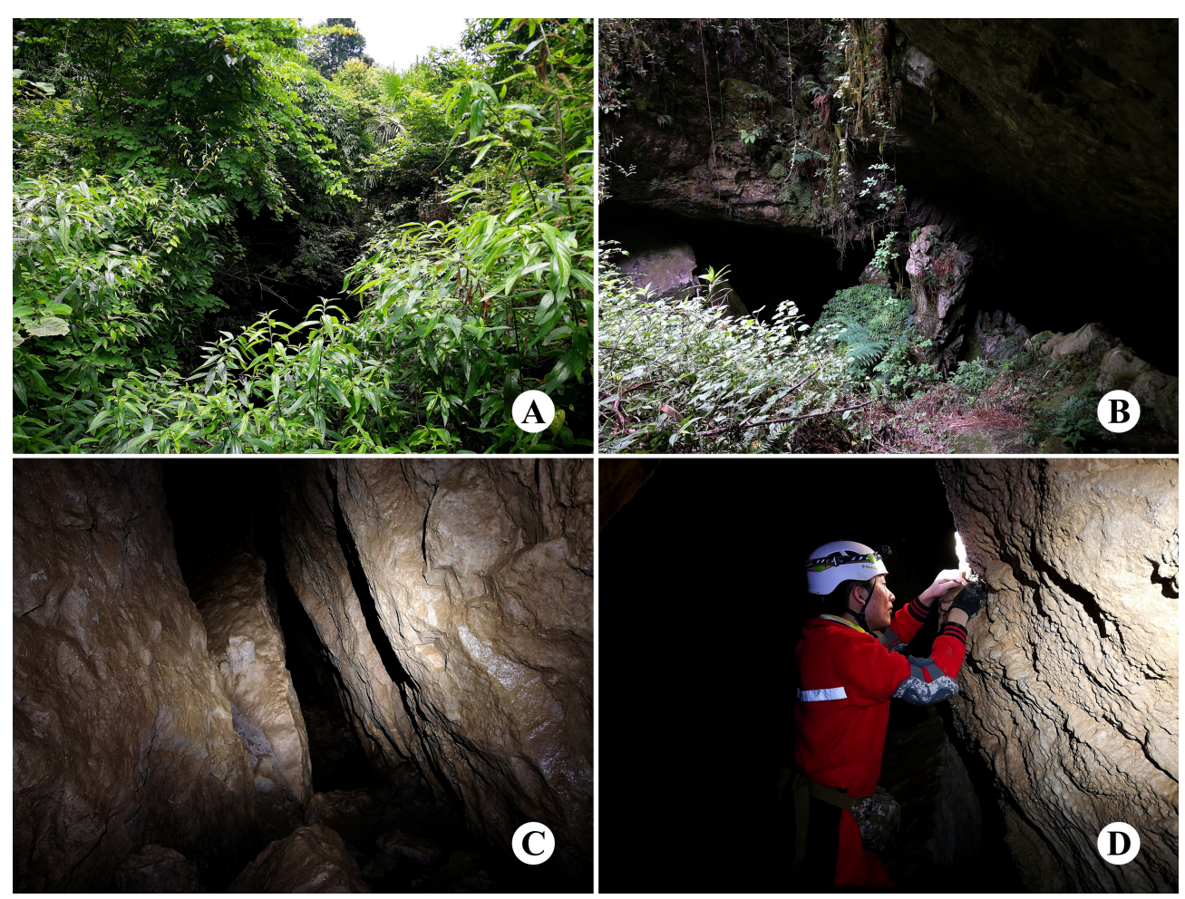
On page 63, the FIGURE 52 should be displayed as follows:

Several small errors were found in the article regarding figure sequencing. The sequence of Figures 52–56 is incorrect, leading to a mismatch between the figure and the legend. To rectify this error, the sequence of the figures has been updated to ensure their proper alignment: