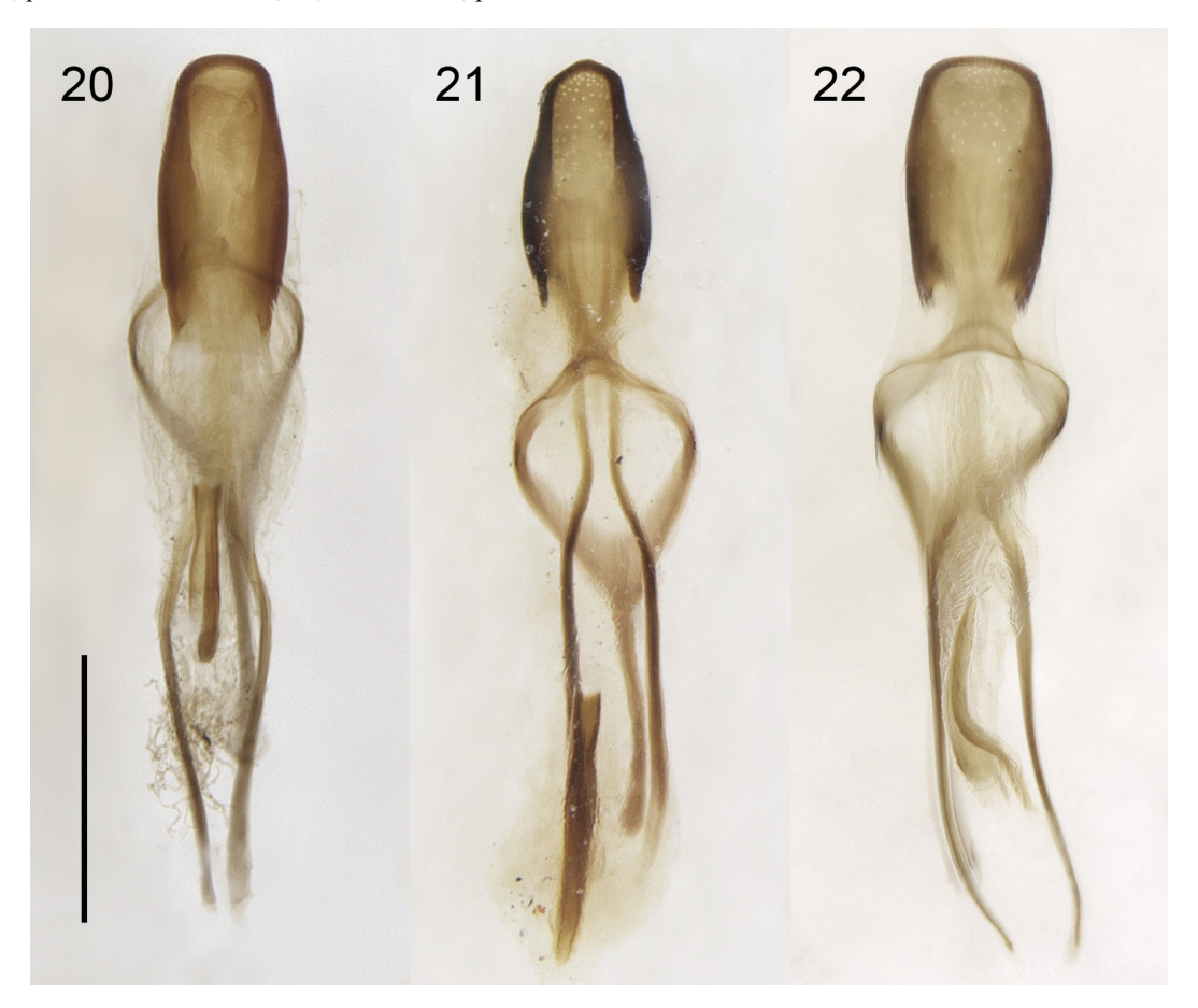
FIGURES 20–22. Crostis boreas species group, male genitalia, dorsal aspect. 20, C. boreas , Texas; 21, C. boreodes , Michoacán; 22, C. caperata , Chiapas. Scale bar 0.2 mm.