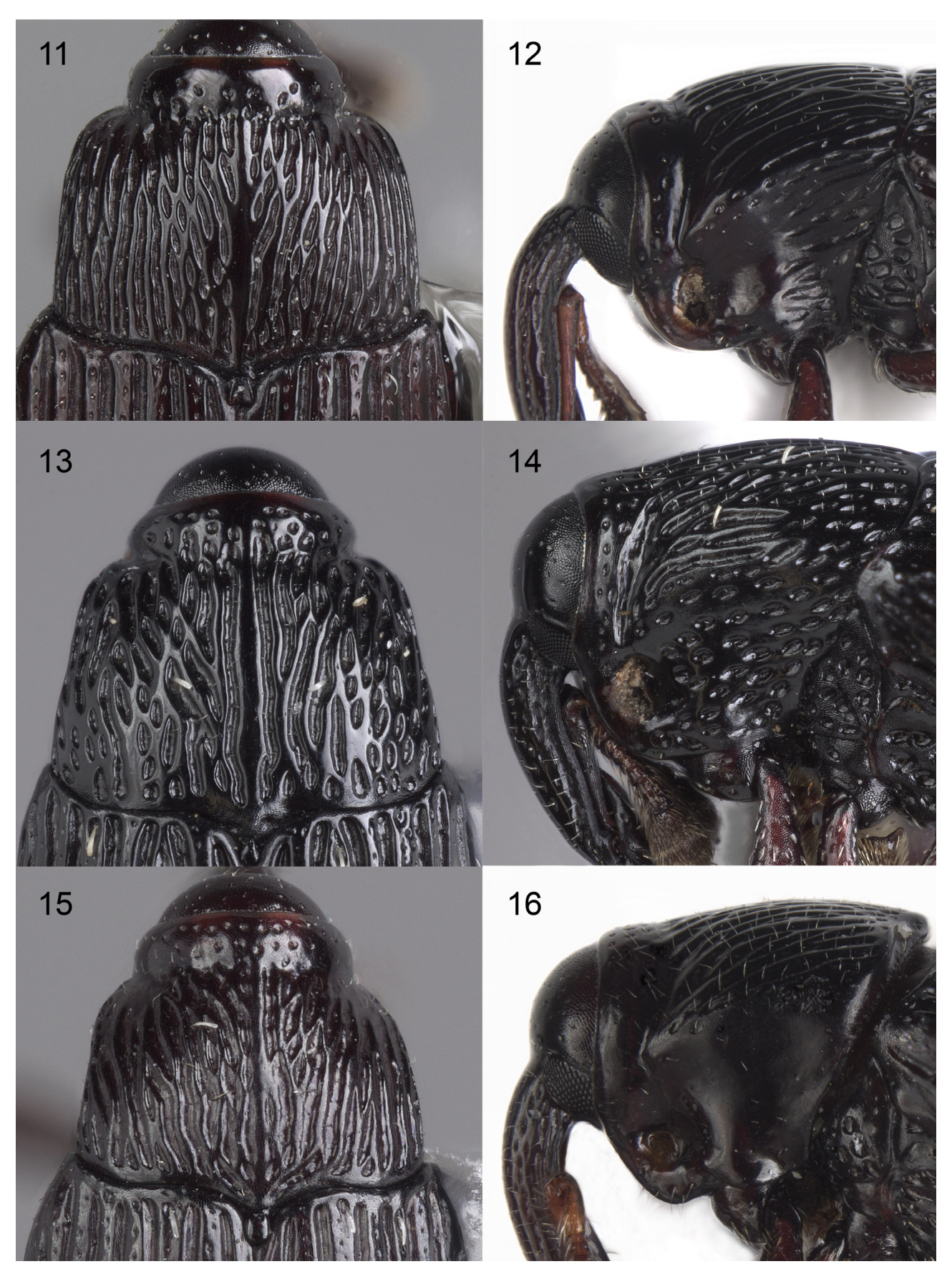
FIGURES 11–16. Crostis boreas species group, details of pronotum. 11, 12, C. boreas , Texas; 13, 14, C. boreodes , Michoacán; 15, 16, C. caperata , Chiapas.