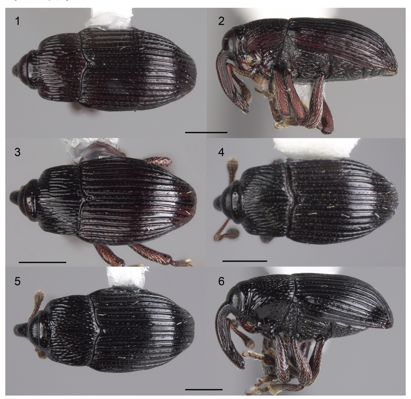
FIGURES 1–6. Crostis boreas , dorsal and lateral aspects. 1, 2, elongate male, Texas; 3, elongate female, Querétaro; 4, moderately stout female, Querétaro; 5, 6, very stout male, Querétaro. Scale bars 0.5 mm.

Diagnosis. Total length 2.2–3.0 mm; body form oblong-ovate, L/W elytra 1.19–1.43 (Figs. 1–6). Characteristic for this most northern species of Crostis are (i) transverse pronotum with disc longitudinally striate and posterior (only) portion of flanks striate or with elongate punctures (Figs. 11–12), (ii) length of first funicular article subequal to combined lengths of articles 2–4, (iii) punctures of ventrites I and II smaller, lateralmost areas of ventrite I with 3–4 punctures along length (Fig. 18), and (iv) penis with apex truncate, slightly expanded laterally towards base, endophallus distally with asymmetrical, elongate, fluted, gutter-like endophallite with one margin longer, much thicker and more heavily sclerotized than the other, duct attached to the latter, apodemes ca. 1.7× longer than length of penis body (Fig. 20).