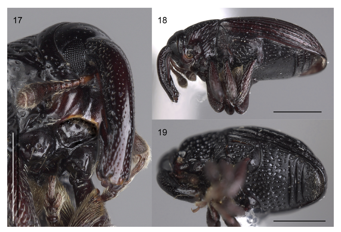
FIGURES 17–19. Crostis boreas species group, ventral aspects. 17, C. boreas , prosternum with anteriorly covered fovea; 18, C. boreas , punctation on ventrites; 19, C. boreodes , punctation on ventrites. Scale bars 0.5 mm.