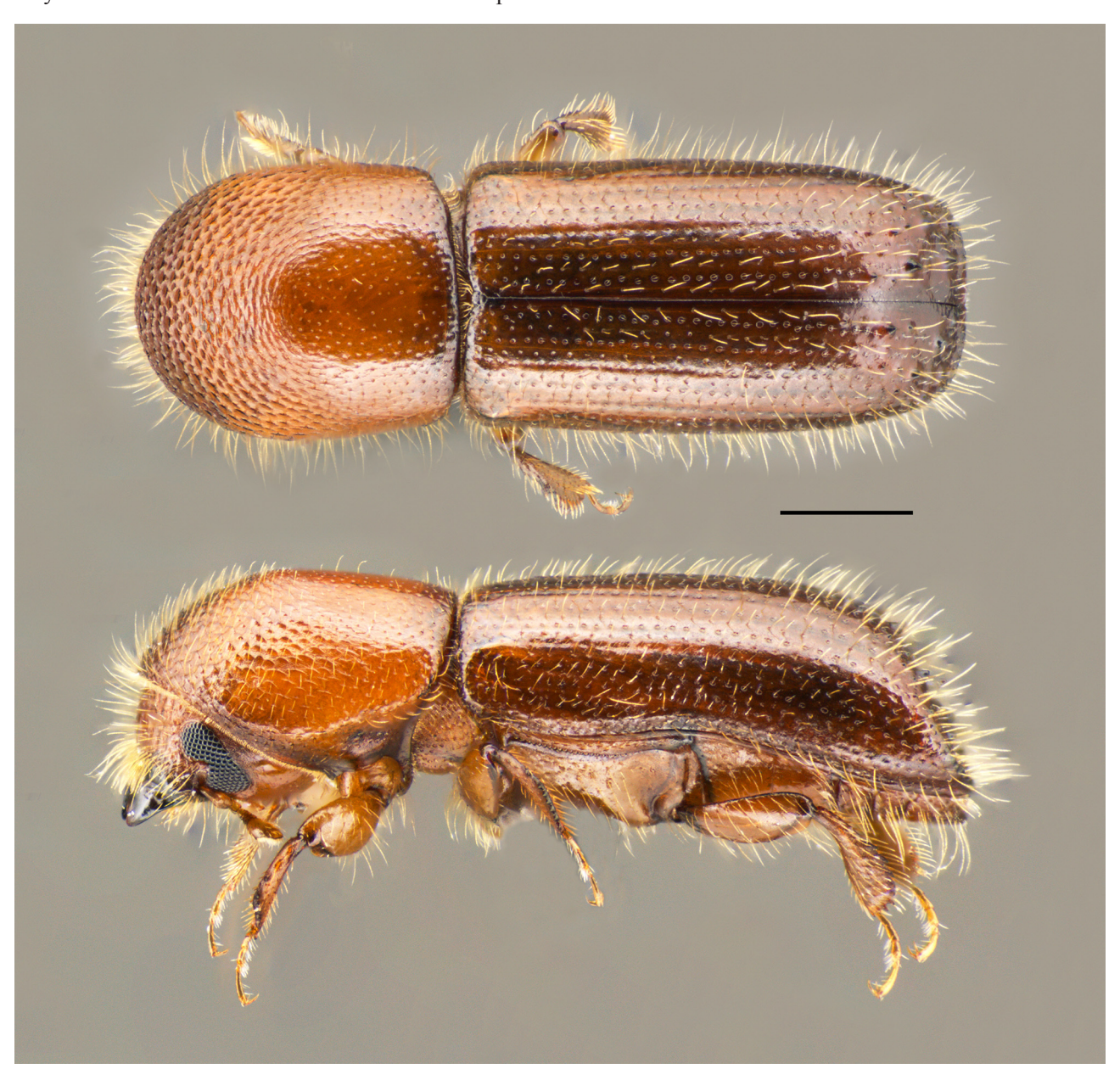
FIGURE 1. Dorsal and lateral habitus of Xyleborus monographus . Scale bar represents 0.5 mm.

As with all xyleborine ambrosia beetles, X. monographus exhibits sib-mating, with haploid and wing-less males (Kirkendall 1993). Schedl (1964) reports a sex ratio of 8.5:1 females to males. Other species of xyleborines have been reported to have ratios similar to this or more females to males (Smith & Hulcr 2015), and additional studies may show a more female biased sex ratio for this species as well.