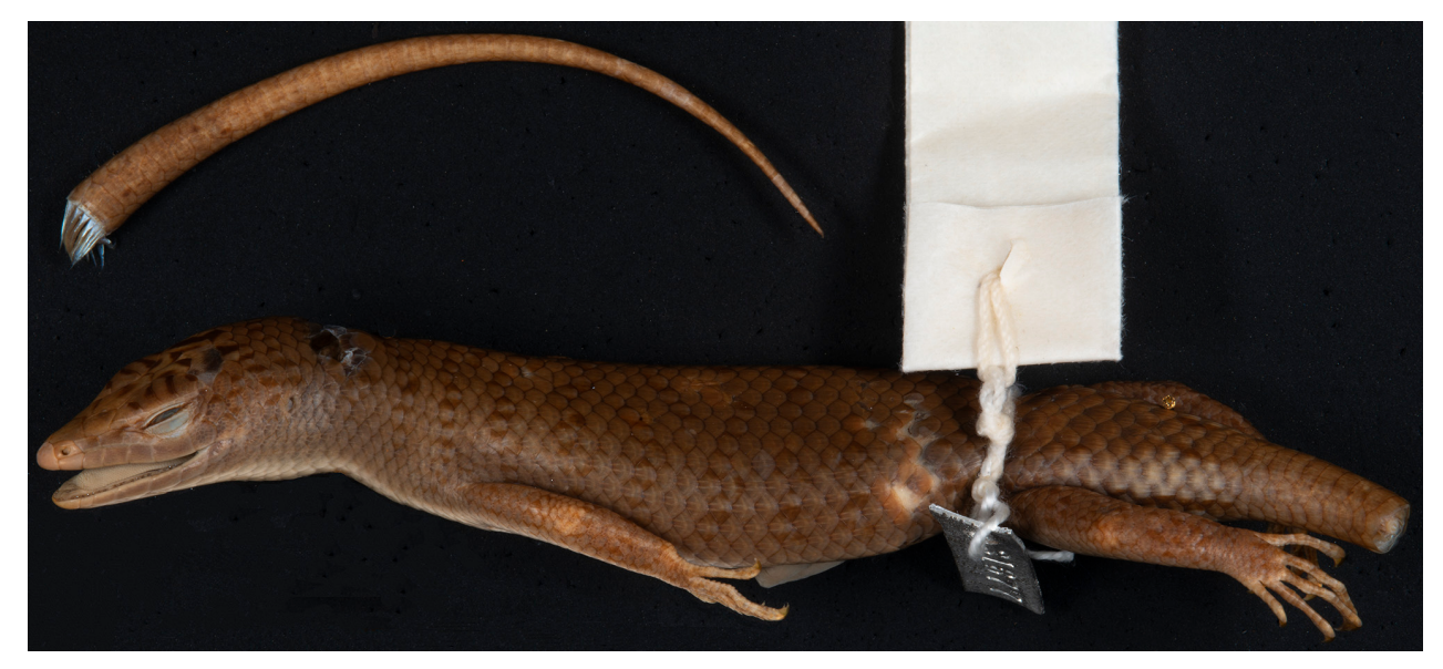
FIGURE 3. USNM 31677, the only other specimen of Dasia olivacea reported from Pulau Nias, the type locality of M. wirzi .

FIGURE 2. Head shields of Dasia olivacea in lateral view (Australian Museum R6815), showing the absence of a postnasal posterior to the nasal scale (N), the configuration of temporal scales, with a primary temporal (1°) and upper and lower secondary temporals (U2° and L2°), and the very small ear in this species. Scales a and b are respectively the last supraciliary and the uppermost postsubocular, using the definitions of Taylor (1936). These two scales constitute the pretemporals of Greer (1983). Scale bar = 5mm.