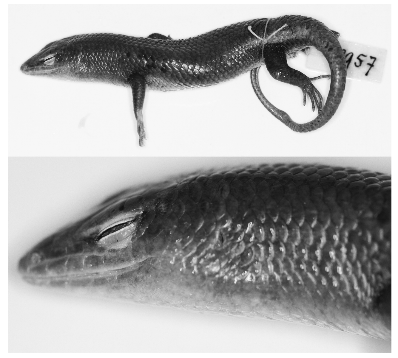
FIGURE 1. Holotype of Mabuia wirzi in dorsolateral view, with details of the lateral side of the head.

1) closely resembles that species. Particularly important in identifying Mabuia wirzi as a Dasia species are the enlarged glandular heel scales, a diagnostic feature of that genus (Greer 1970), and lacking in Eutropis , although previous definitions of Dasia record only two enlarged heel scales for species in the genus (Greer 1970; Karin et al. 2016). The simple temporal configuration of one primary temporal, not reaching the parietal, and two secondary temporals with the upper overlapping the lower and contacting the parietal (Fig. 1), is also a feature of Dasia olivacea (Fig. 2; de Rooij 1915; Fig. 77) while Eutropis multifasciata and other Eutropis species have a more complex temporal configuration (Greer & Broadley 2000; Greer & Nussbaum 2000). Grismer (2011) reports two primary temporals for D. olivacea , but this is likely to be based on a different definition of temporal scalation (possibly that of Grismer et al. 2011 for Larutia , where the scales labelled primary temporals are the equivalent of the pretemporals of Greer 1983, and the posterior supraciliary and upper postsubocular of Taylor 1936). We use Taylor's nomenclature for these scales.