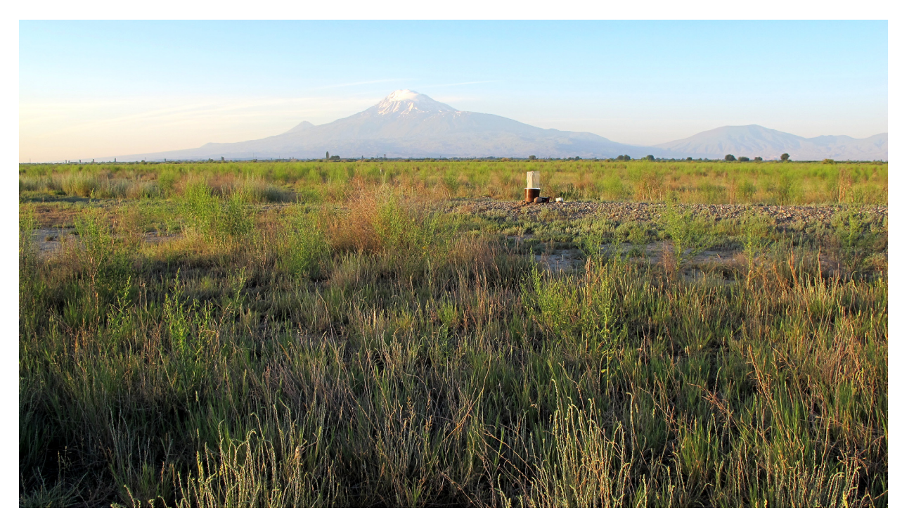
FIGURE 17. "Vordan Karmir" State Sanctuary, Armenia – the biotope of Anoxia (Protanoxia) maljuzhenkoi (Zaitzev, 1928). Photograph by Jan Šumpich, June 2017.

Pronotum transverse, moderately convex with distinct longitudinal groove in the middle, widest approximately in the middle. Basal border present, broadly interrupted in the middle, lateral borders complete, anterior border missing. Lateral margins weakly crenate. Anterior margin regularly, broadly sinuate. Anterior angles obtuse-angular; posterior angles broadly rounded. Punctation consisting of coarse, irregularly-spaced punctures becoming denser in the longitudinal groove, each puncture bearing white, scale-like, recumbent macroseta; two rounded, impunctate, bare lateral areas on each side of pronotum present.