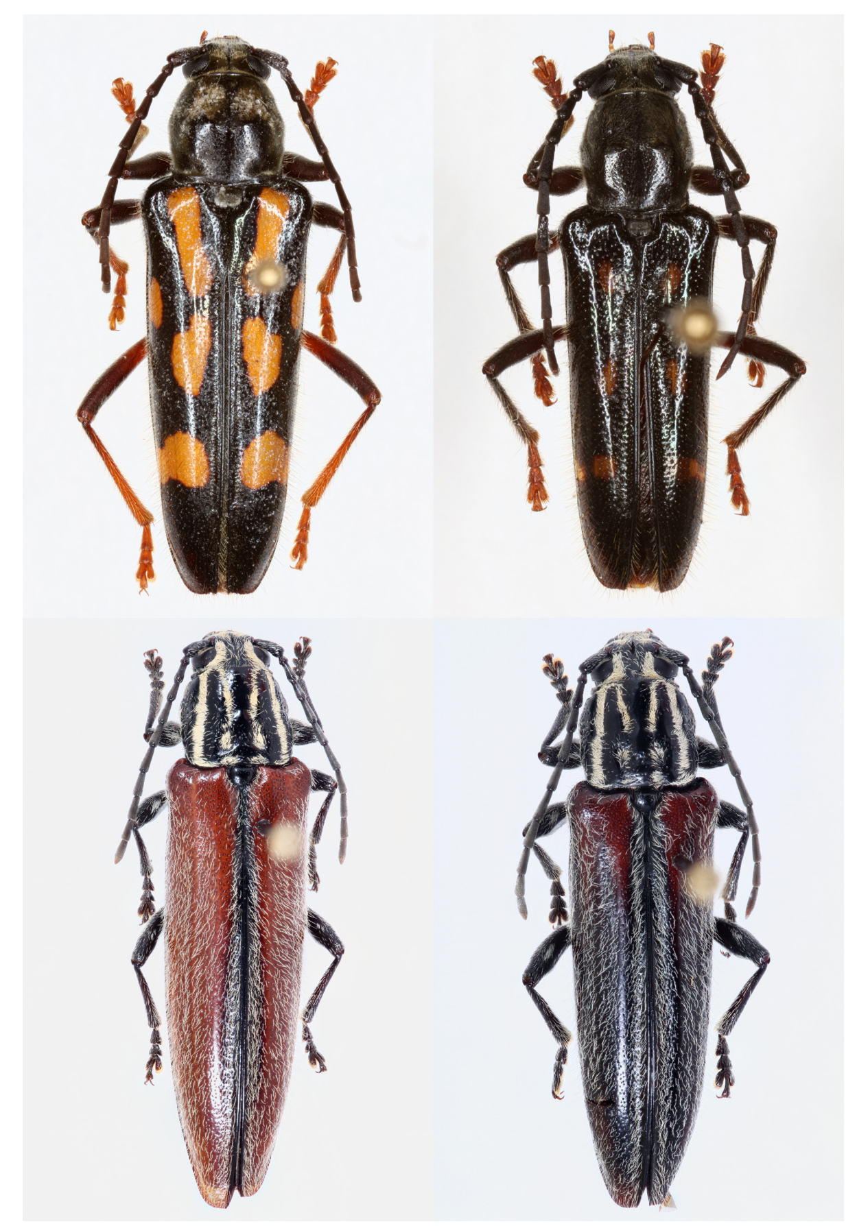
FIGURES 1–4. 1 . Agallissus lepturoides (typical pattern), female. 2 . Agallissus lepturoides (melanistic form), male. 3 . Osmopleura chamaeropis (typical color), female. 4 . Osmopleura chamaeropis (atypical dark color), male.