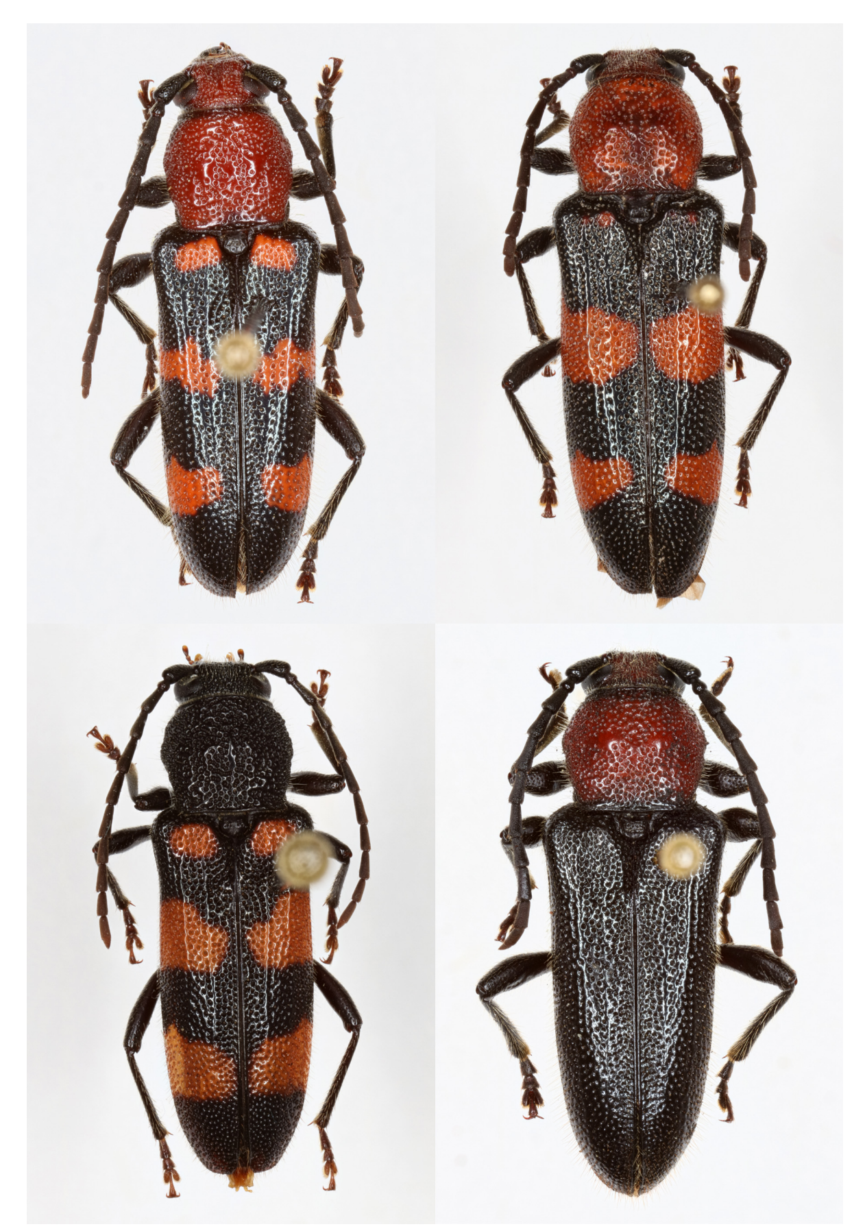
FIGURES 5–8. 5. Zagymnus clerinus (typical pattern), male. 6. Zagymnus clerinus (typical pattern), female. 7. Zagymnus clerinus (typical pattern), male. 8. Zagymnus clerinus (atypical form), male.