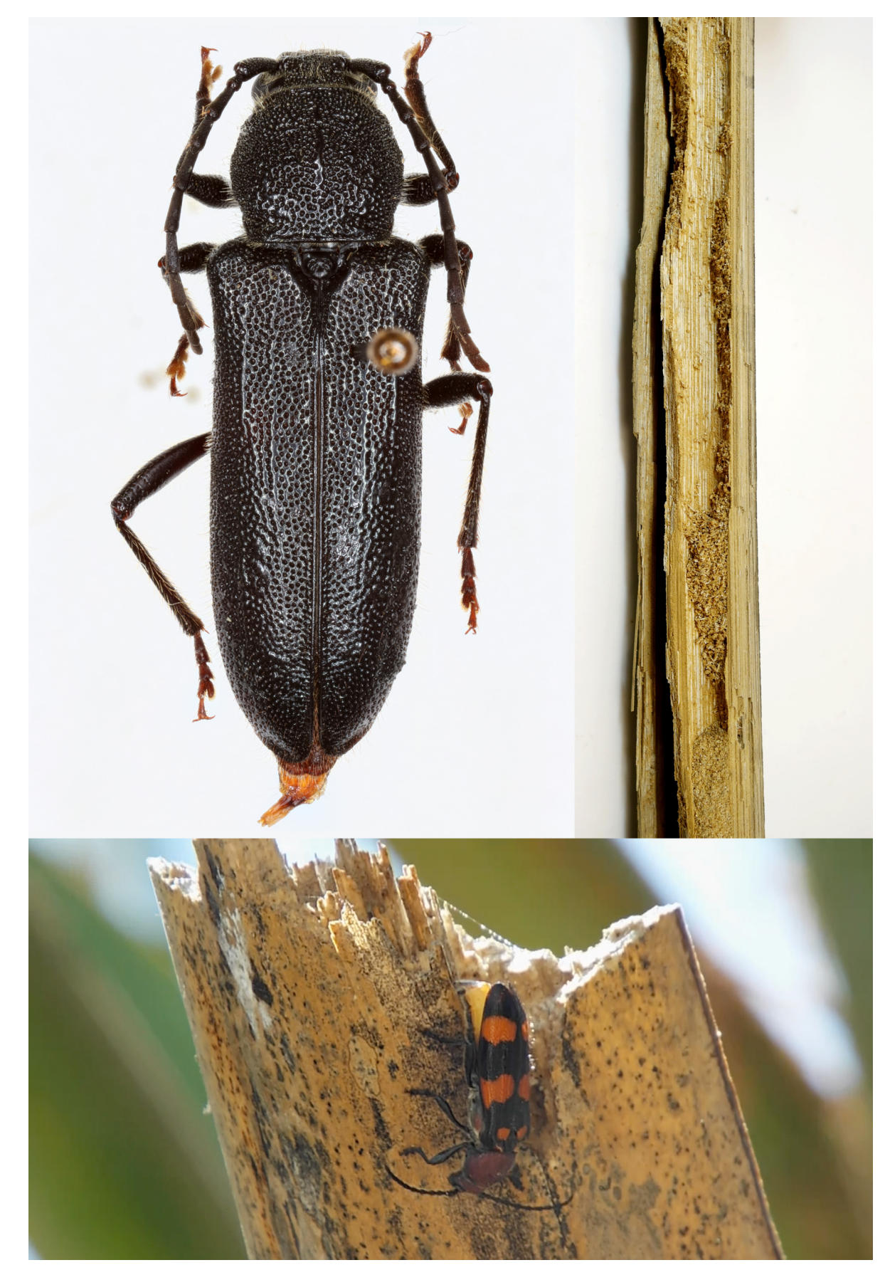
FIGURES 9–11. 9. Zagymnus clerinus (rare black form), female. 10. Larval workings of Agallissus lepturoides in petiole. 11. Zagymnus clerinus ovipositing.