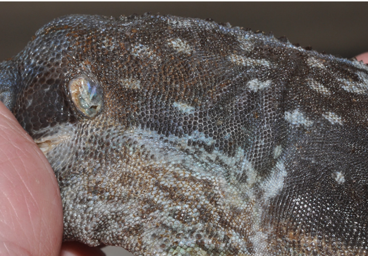
FIGURE 5. Left side of head and neck of the specimen illustrated in Brongniart (1805) (left) and MNHN-RA 6812 (right) showing bicolored head, with white throat containing grey spots. Also nuchal white spotting is typical of Brachylophus fasciatus and obvious in the illustration of the holotype. Note, however, that engraver has not fully respected the disposition and number of the lateral dark and light head marks.