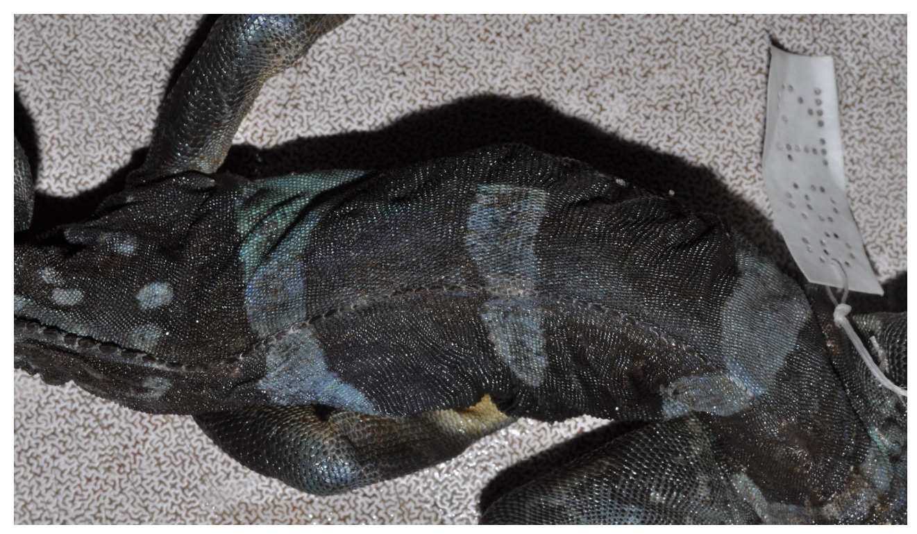
FIGURE 4. Mid-dorsal photograph of MNHN-RA 6812 illustrating saddle-like second dorsal band instead of a complete band. Large nuchal white spots also present in this photo.