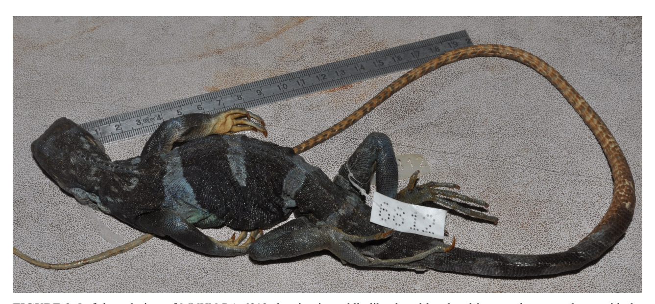
FIGURE 3. Left lateral view of MNHN-RA 6812 showing its saddle-like dorsal band and its complete accordance with the specimen illustrated in Fig. 1 above.

fading after more than 220 years in preservative, with some lighter spots disappearing (Figs. 1, 5), but also to the engraver who probably did not consider the position and number of the spots as important. We also checked the engraving with the opposite right side of the type specimen in the case engraving was mirrored but this seems not to be the case and differences were even greater. The abnormal mid-dorsal light band undoubtedly confirms MNHN-RA 6812 as the holotype described by Brongniart (1800). The specimen has 102 spines on its dorsal crest from above cloaca to the neck, thus being a typical B. fasciatus .