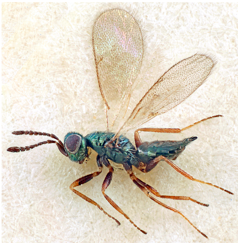
FIGURE 14. Foersterella sp., female, habitus in lateral view, specimen length 1.2mm. Specimen from England, Middlesex, collected and mounted by M.W.R. de V. Graham (specimen in BMNH).

Distribution. Austria, Czechoslovakia, Denmark, Germany, Hungary, Sweden, Yugoslavia (all seven records in Bouček 1958), France (Labeyrie 1961), Italy (Herting 1973), Romania (Herting 1973), United Kingdom (Graham, 1963). In view of the confusion with species identification, distribution records in literature must be regarded with caution.