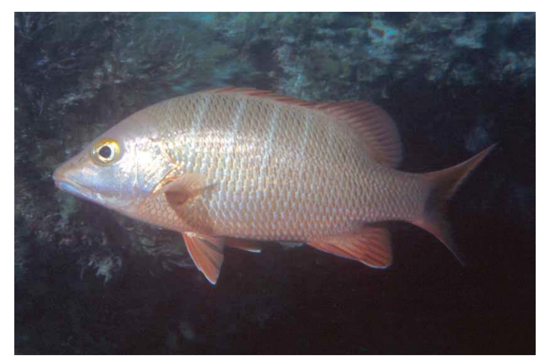
FIGURE 2. Underwater photograph of Lutjanus alexandrei . Parcel das Paredes (17°53'54"S, 38°57'13"W), Abrolhos Bank, Bahia, Brazil (R.L. Moura).