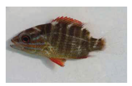
FIGURE 3. Early juvenile individual of Lutjanus alexandrei , 27 mm SL, collected in the mouth of Rio Mamucabas, Tamandaré (08°49'S, 035°05'W), State of Pernambuco, Brazil, 1 m depth (Beatrice P. Ferreira & Sérgio Resende, 18 February 2005).

Distribution, ecology and behavior. The Brazilian snapper, L. alexandrei is only recorded from the tropical portion of the southwestern Atlantic continental shelf, and has a narrower latitudinal range than other Western Atlantic species of Lutjanus . It is known from the state of Maranhão (00°52'S) to the southern coast of the state of Bahia (18°0'S), Brazil, in areas under the influence of the west-flowing Equatorial Current (northern Brazil) and the south-flowing Brazil Current (northeastern Brazil). It is apparently absent from oceanic islands. Additional collections may show an even broader distributional range for this species, as was the case with 48 other poorly known reef-fish species in the southwestern Atlantic (Moura et al. 1999).