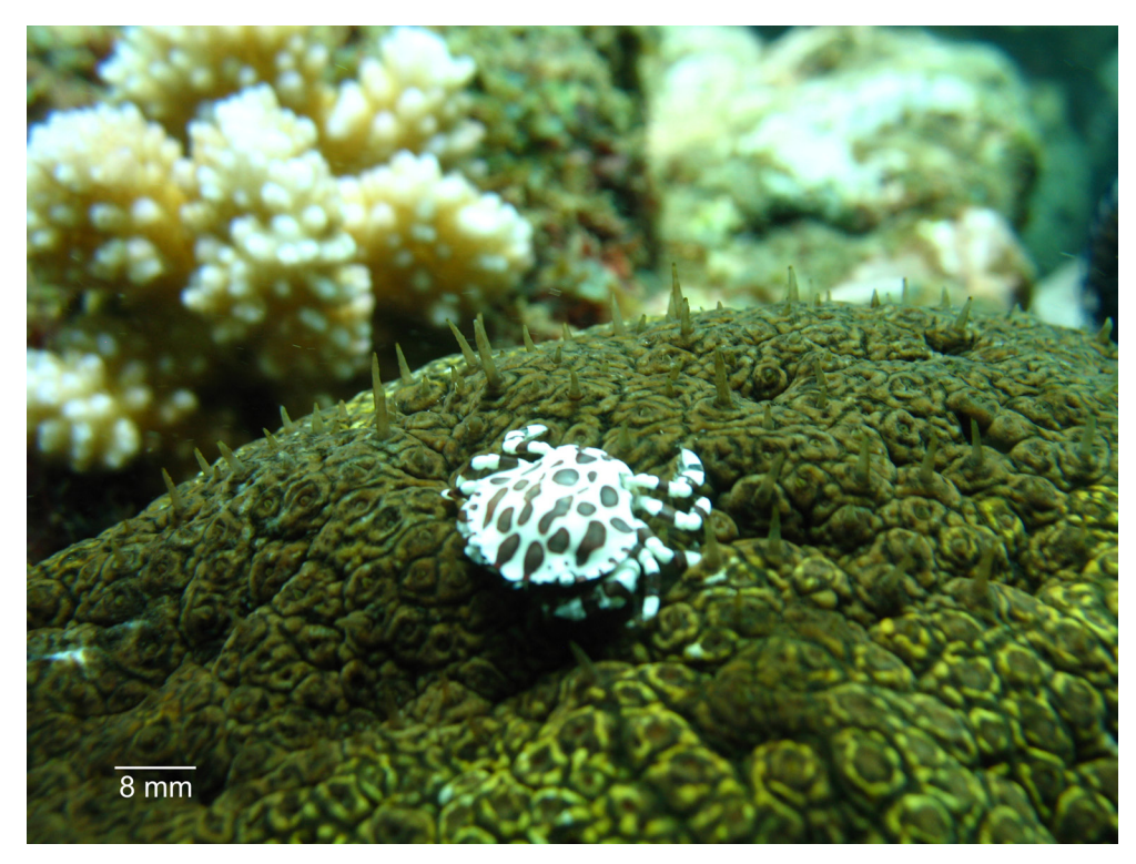
FIGURE 1. The Harlequin crab, Lissocarcinus orbicularis Dana, 1852 on its host.