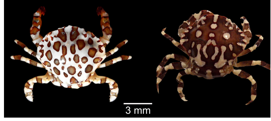
FIGURE 2. External morphology of the Harlequin crab viewed from above.