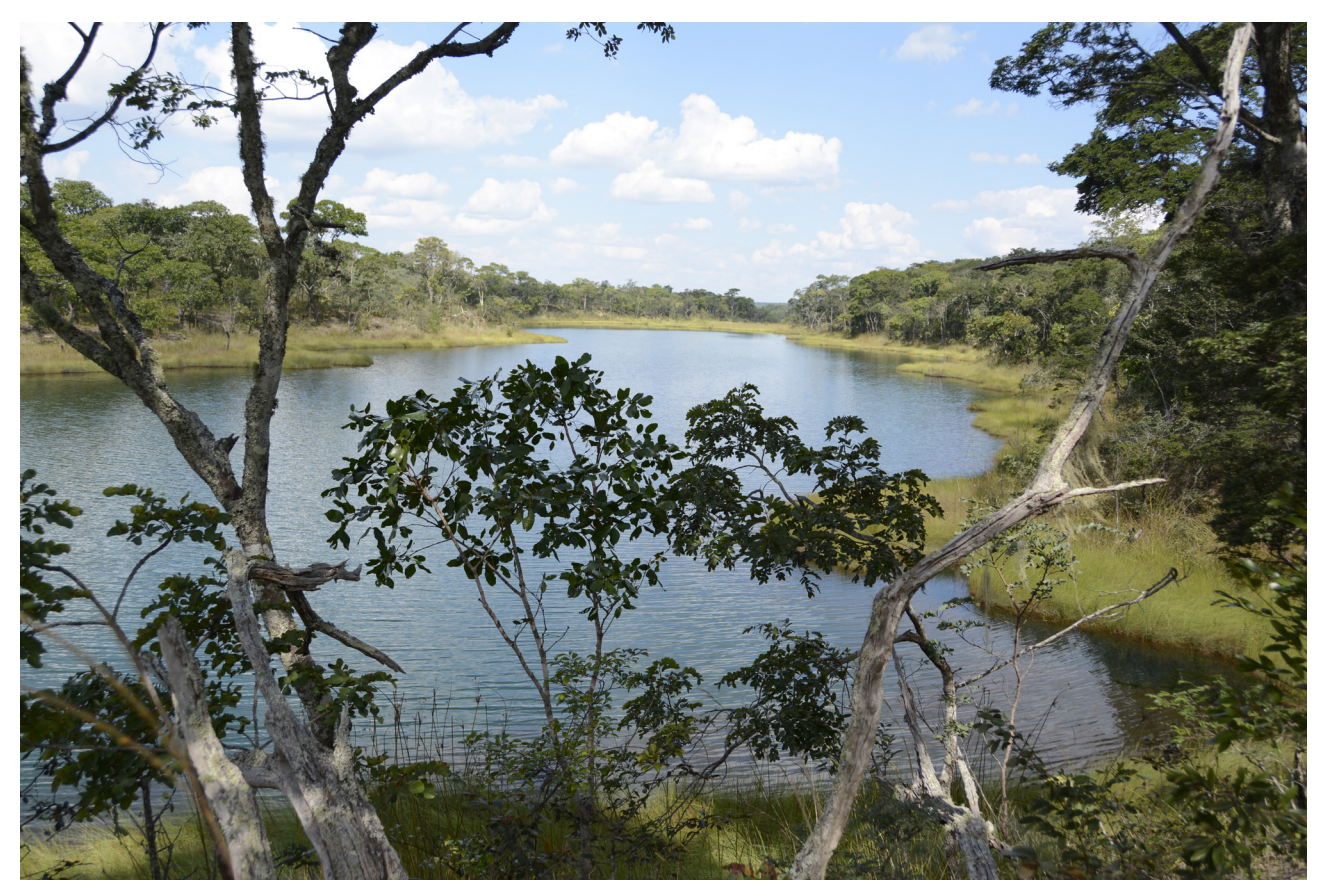
FIGURE 5. Lake Tchanssengwe, the source lake feeding the Lungué-Bungo River.