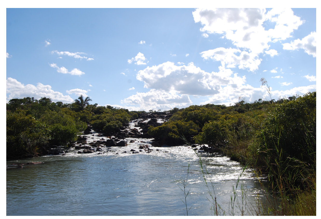
FIGURE 3. Section of Cubango River, showing a typical rapid over rocky substrate.

H. triaxialis is found in the Cubango and the Cuanza Rivers in Angola, and in the Luanza River in the DRC (Luanza to Kabiashia, Kasenga district). Typically, this plant provides specialised habitat for mayflies. Unlike the Cubango River, the other headwater rivers all flow over deep Kalahari sands. These sandy bottom rivers may also be swift flowing, and even the smaller tributaries can be deep (too deep to stand in places). They are all surrounded by waterlogged grass and sedge vegetation, often with a variety of densely growing rooted aquatic macrophytes living under water, which provide habitat for the invertebrates.