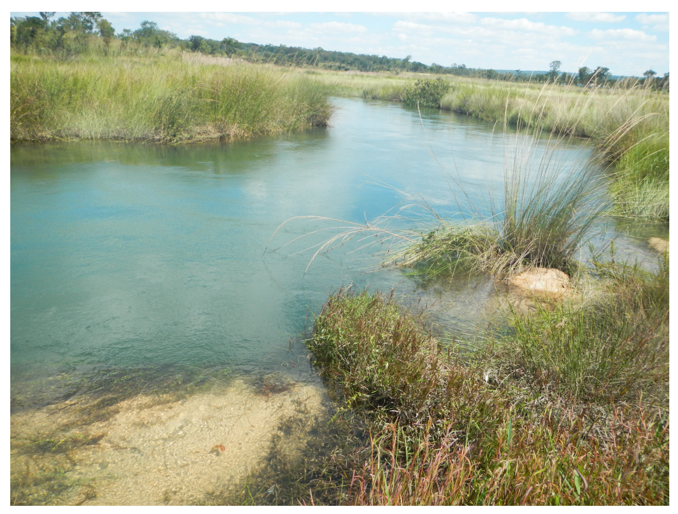
FIGURE 4. The Lungué-Bungo River, a fast flowing, often deep river with sandy substrate.

All specimens were preserved in 80% ethanol, labelled and given an Albany Museum CAW (Central African Waters) field catalogue number. Samples were sorted in the Albany Museum after the fieldtrips, further catalogued and identified to the lowest taxonomic rank possible for each group, for incorporation into the Albany Museum's Department of Freshwater Invertebrate collection. Some of the adults were associated with the aquatic stages in the laboratory, linked by the fact that they were collected at the same site, although further linking of life stages needs to be the done using DNA barcoding.