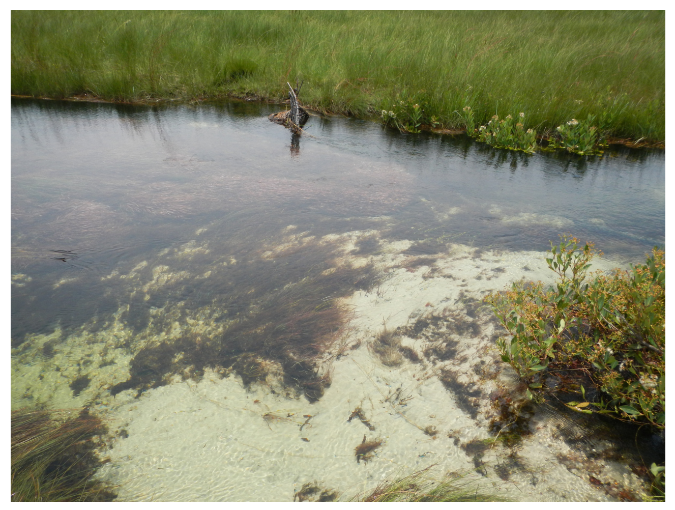
FIGURE 2. The outflow of Cuanavale Source Lake, showing a typical stretch of river flowing over Kalahari sand substrate, with aquatic macrophytes and riparian sedges and grasses.

Since 2015, several expeditions have been organised to this largely untouched region of source lakes, upland rivers, and miombo forests. The headwaters of these rivers lie at elevations between 1200 and 1500 masl. The Albany Museum joined three of the expeditions to assess the biodiversity of freshwater macro-invertebrates in this area, collecting at sites shown in Fig. 1. The first, the October–November 2016 Cuito-Cuando expedition, included the Cuito and Cuanavale Rivers and tributaries, which flow to the Okavango, and those flowing into the Zambezi River system. Specimens were collected from 23 sites across six river systems, Cuito (one site), Cuanavale (nine sites), Cuando (eight sites), Cuembo (three sites), Lungué-Bungo (one site) and Luanginga (one site). The Cubango River expedition followed in May 2017, with 23 sites along the upper Cubango River catchment, including mainstream river sites (Fig. 3), tributaries, isolated pools, wetlands and seeps. The Lungué-Bungo River (Fig. 4) and tributaries was the focus in April 2018, with 22 sites collected along the Lungué-Bungo, Comba and Cacau Rivers and the source lake, Lake Tchanssengwe (Fig. 5).