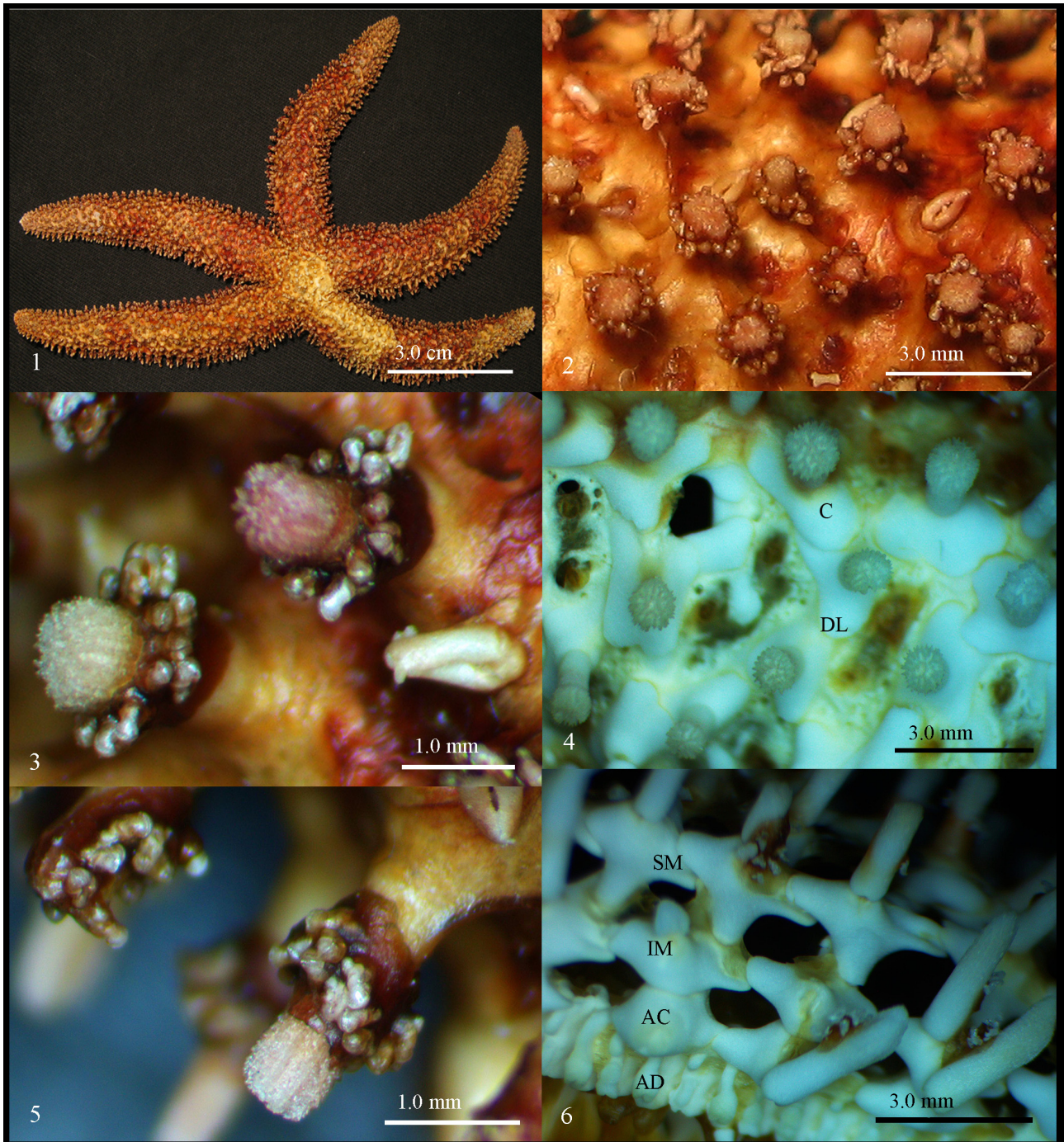
FIGURES 1–6. Leptasterias tatei sp. nov., Holotype, 2011-158.001. Fig. 1, whole animal, aboral, Bar = 3.0 cm. Fig. 2, aboral surface, Bar = 3.0 mm. Fig. 3, aboral spines & pedicellariae, Bar = 1.0 mm. Fig. 4, aboral surface cleaned of tissue, showing carinal [C] and dorsolateral [DL] ossicles & spines, Bar = 3.0 mm. Fig. 5, aboral spine with pedicellariae, Bar = 1.0 mm. Fig. 6, marginal area of ray, cleaned of tissue, showing arrangement of ossicles (superomarginal [SM], inferomarginal [IM], actinal [AC], and adambulacral [AD]), Bar = 3.0 mm.