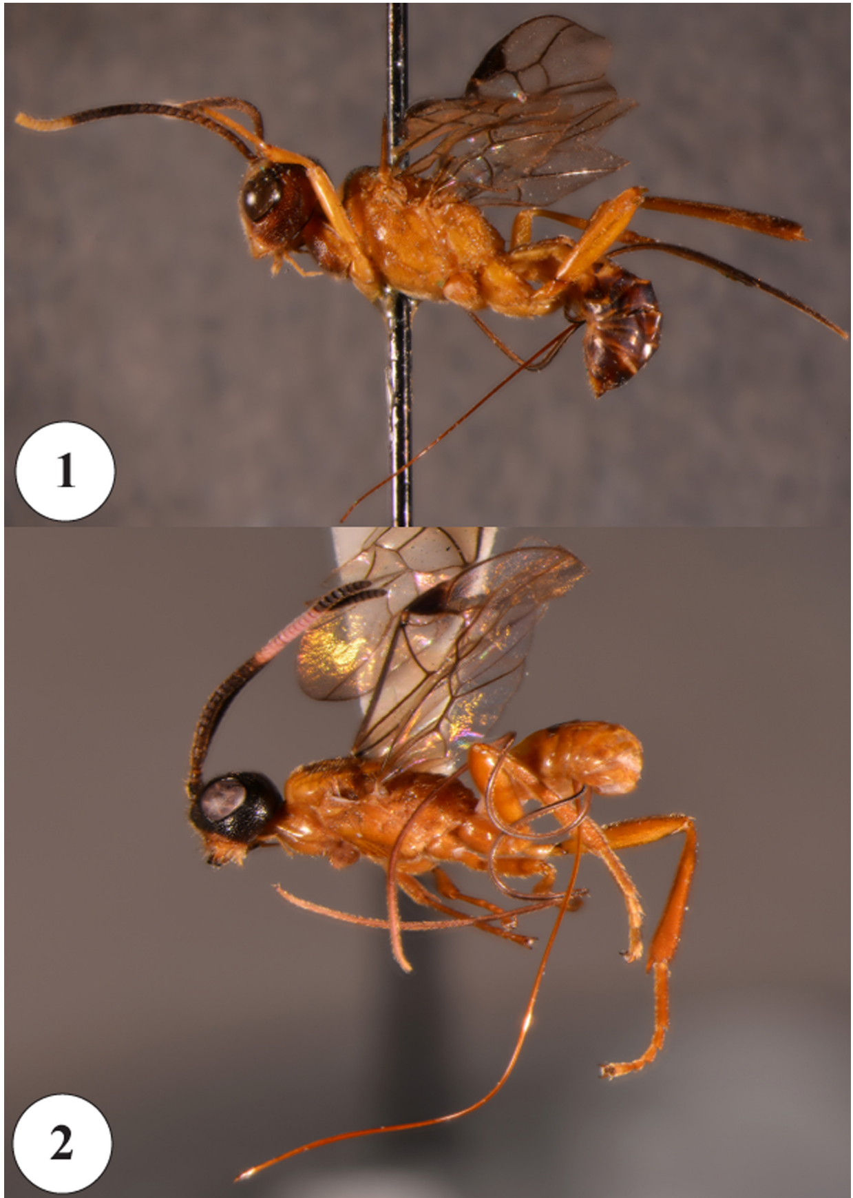
FIGURES 1–2. 1. Lateral habitus of Eudiospilus conradti holotype. 2. Lateral habitus of Eudiospilus rubrumbarus holotype.