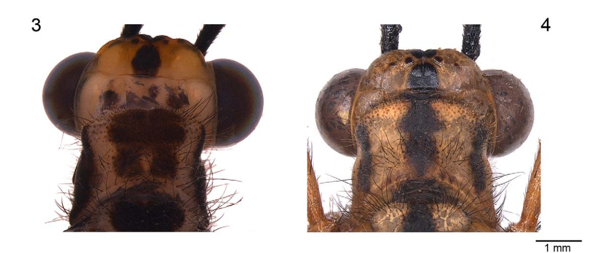
FIGURES 3–4. Pronotum of Megistoleon species. 3. M. ritsemae (Gabon, Ipassa), alcohol preserved specimen. 4. M. thaumatopteryx sp. nov., holotypus, female (Mozambique, Sofala prov.).