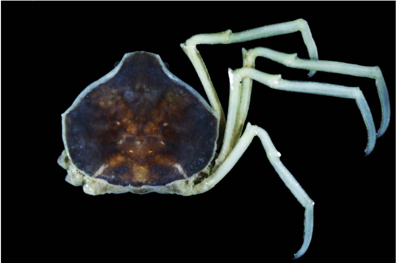
FIGURE 3. Elamena samalensis sp. nov. , paratype, ♀, 5.5 × 4.8 mm (ZRC 2013.0095), Samal Is. Freshly-preserved coloration.