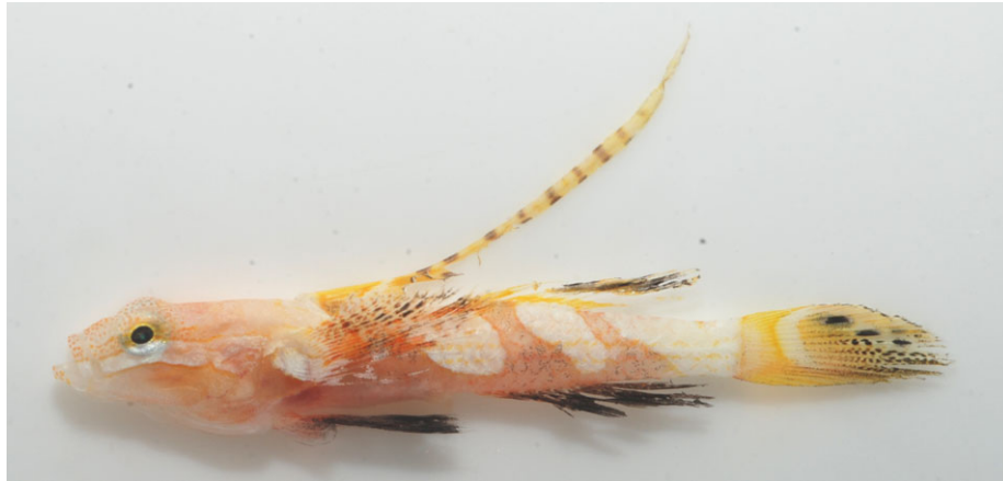
FIGURE 3. Discordipinna filamentosa , NSMT-P10437, male, holotype, 15.7 mm SL, Kumejima, the Ryukyu Islands, Japan.

Morphological comparison with the congeners. Discordipinna filamentosa n. sp. can be well distinguished from the type species, D. griessingeri Hoese & Fourmanior, 1978, in this genus by the following features: (1) fin ray counts: first dorsal fin rays VI vs. V; pectoral fin rays 16 vs. 17–20; (2) dorsal pterygoiphore formula 3/122101/9 vs. 3/41001/8; (3) dorsal fin shape: first ray of first dorsal-fin longest in male vs. second ray of dorsal-fin base longest in male; and its fin membrane simply pointed vs. biforked; (4) head canals: preopercular canal present vs. preopercular canal absent; and (5) specific coloration pattern: head with a horizontal white band vs. many round, deep black spots; pelvic fin with a snow-white oblique, wide band vs. unmarked pale white background; first dorsal fin with about 12 transverse brown bands vs. entirely orange red; and anal fin entirely black vs. with lower 2/3 region orange red and upper 1/3 region translucent.