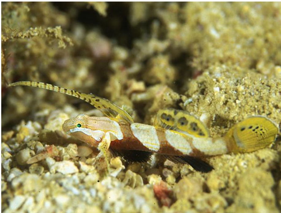
FIGURE 4. Live underwater photograph of Discordipinna filamentosa , KPM-NR 38565, Okinawa Island, the Ryukyu Islands, Japan. 37 m depth, 3 Aug. 2000.

Morphological comparison with the congeners. Discordipinna filamentosa n. sp. can be well distinguished from the type species, D. griessingeri Hoese & Fourmanior, 1978, in this genus by the following features: (1) fin ray counts: first dorsal fin rays VI vs. V; pectoral fin rays 16 vs. 17–20; (2) dorsal pterygoiphore formula 3/122101/9 vs. 3/41001/8; (3) dorsal fin shape: first ray of first dorsal-fin longest in male vs. second ray of dorsal-fin base longest in male; and its fin membrane simply pointed vs. biforked; (4) head canals: preopercular canal present vs. preopercular canal absent; and (5) specific coloration pattern: head with a horizontal white band vs. many round, deep black spots; pelvic fin with a snow-white oblique, wide band vs. unmarked pale white background; first dorsal fin with about 12 transverse brown bands vs. entirely orange red; and anal fin entirely black vs. with lower 2/3 region orange red and upper 1/3 region translucent.