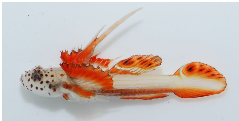
FIGURE 1. Discordipinna griessingeri, NTOUP-2011-01-001, 13.7 mm SL, Mactan Island, Cebu, Philippines.