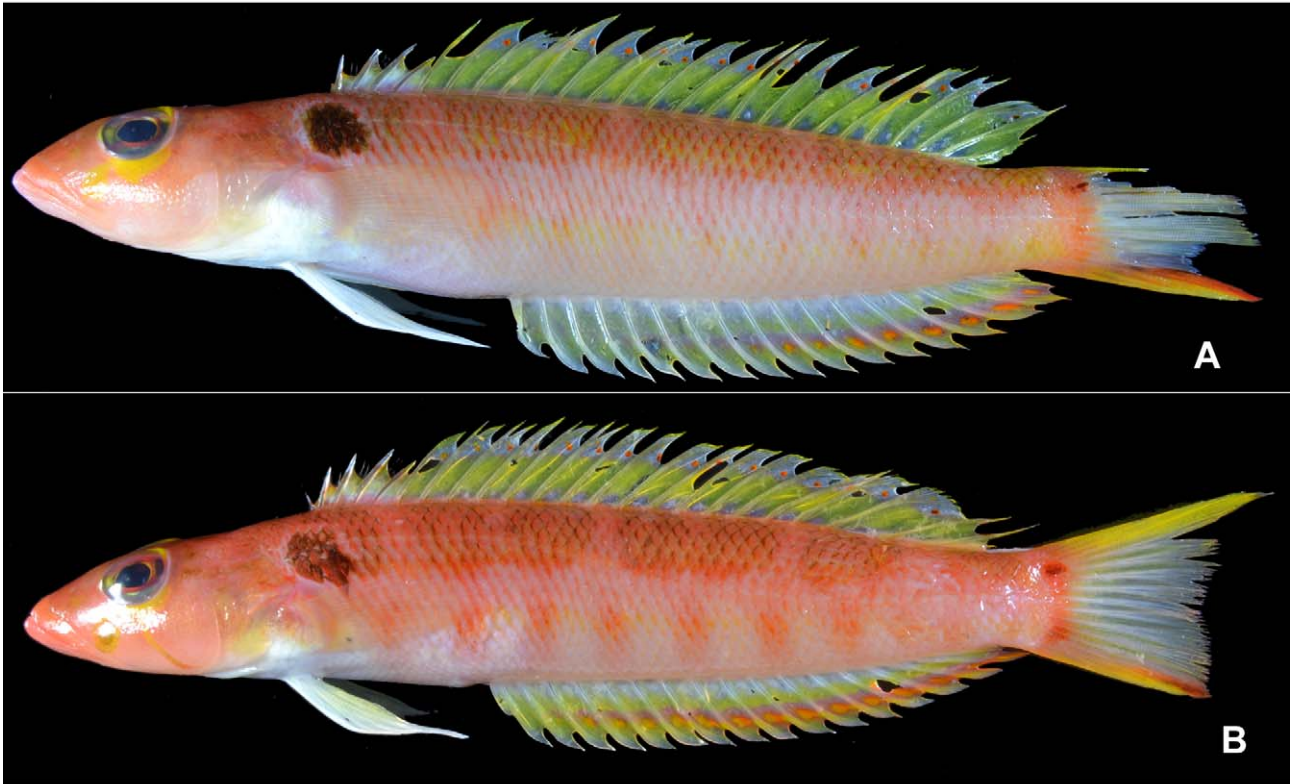
FIGURE 2. Parapercis rufa Randall, 2001. A. NMMB-P11689, 122.7 mm SL. B. NMMB-P11690, 110.7 mm SL.