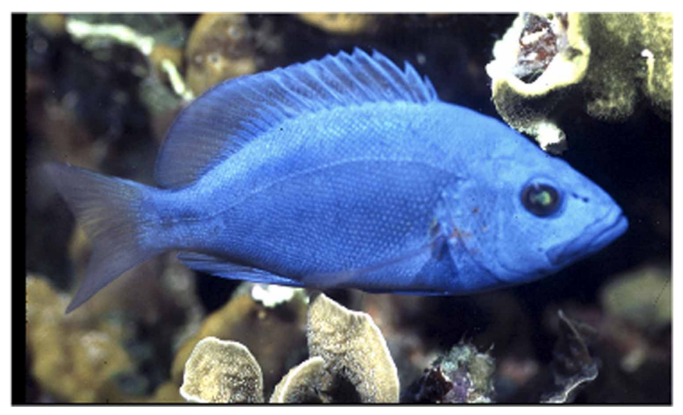
FIGURE 2. Hypoplectrus maya, Tunicate Cove, Pelican Cays, Belize.

sal spine 15.8 (14.3–17.0); base of anal fin 18.5 (13.7–22.6); longest anal spine 14.2 (13.3–14.7); longest anal ray 18.3 (16.2–9.8); caudal fin length 20.7 (14.2–26.6); pectoral fin length 28.9 (25.6–34.4); pelvic fin length 22.8 (20.6–24.3).