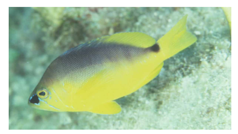
FIGURE 15. H. maculiferus, St Barth's.