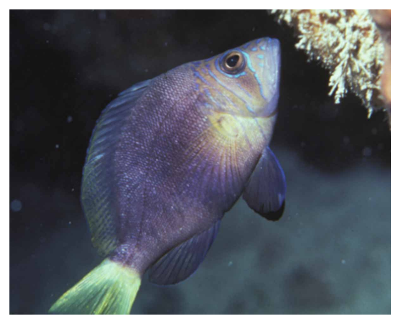
FIGURE 11. H. chlorurus, St. Croix.