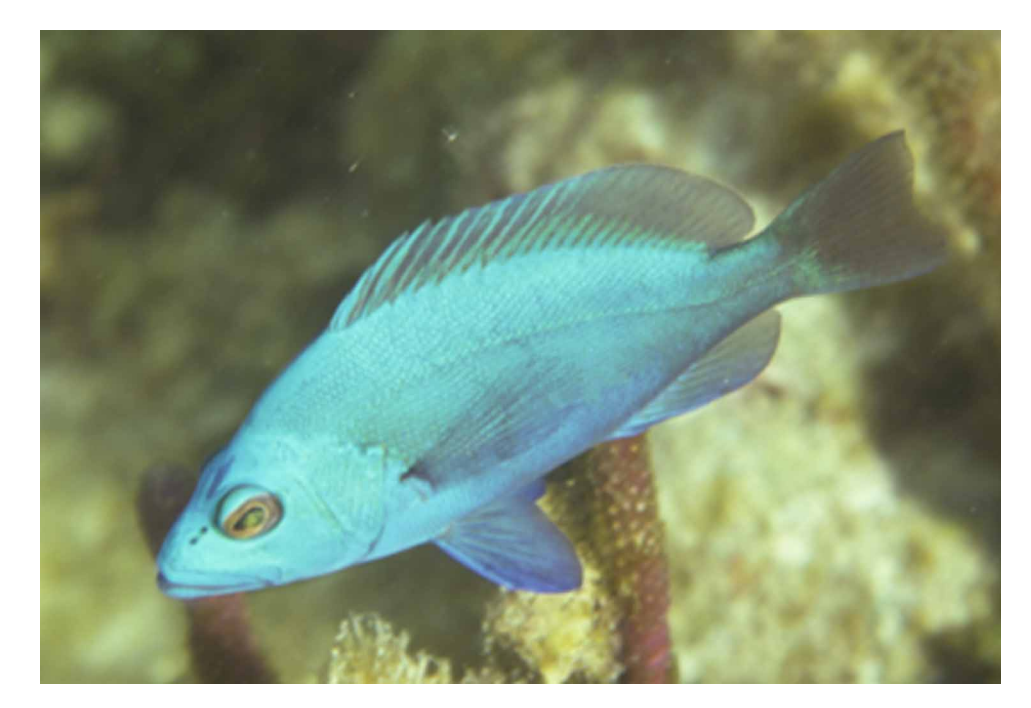
FIGURE 1. Hypoplectrus maya , paratype MCZ 169200, 68.1mm SL, Tunicate Cove, Pelican Cays, 10 November 1994, 3m depth, reef and seagrass.

Paratypes: MCZ 169194, 73.5 mm SL, Tunicate Cove, Pelican Cays, 9 Dec. 2001, 3m depth, reef and seagrass, spear, P. S. Lobel; MCZ 169195, 87.2 mm SL, Tunicate Cove, Pelican Cays, 9 Dec. 2001, 3m depth, reef and seagrass, spear, P. S. Lobel; MCZ 169197, 70.0 mm SL, Tunicate Cove, Pelican Cays, 9 Dec. 2001, 3m depth, reef and seagrass, spear, P. S. Lobel; MCZ 169198, 86.0 mm SL, Tunicate Cove, Pelican Cays, 7 July 1999, 3m depth, reef and seagrass, spear, P. S. Lobel and J. E. Randall (GenBank AY262250);. MCZ 169199, 82.9 mm SL, Tunicate Cove, Pelican Cays, 7 July 1999, 3m depth, reef and seagrass, spear, P. S. Lobel and J. E. Randall (GenBank AY262251). MCZ 169200, 68.1mm SL, Tunicate Cove, Pelican Cays, 10 November 1994, 3m depth, reef and seagrass, spear, P. S. Lobel, photographed underwater (GenBank AY262249). MCZ 169201, 94.4 mm SL, collected with holotype. MCZ 169202, 57.6 mm SL, Tunicate Cove, Pelican Cays, 26 March 1997, 3m depth, reef and seagrass, spear, P. S. Lobel and J. E. Randall.