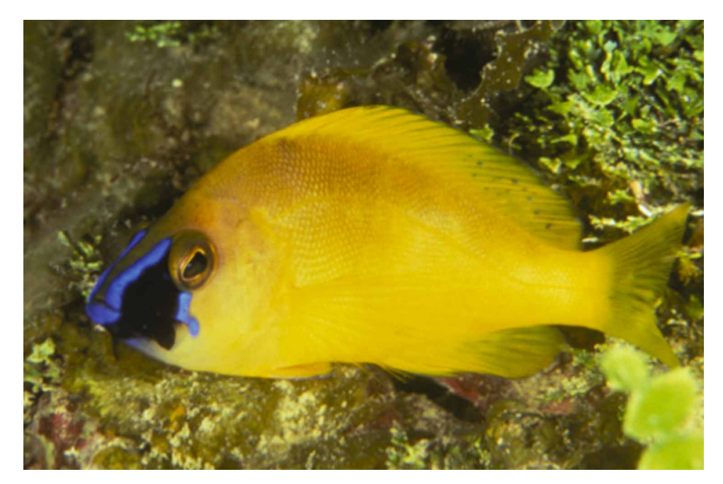
FIGURE 12. H. gummigutta, Jamaica.