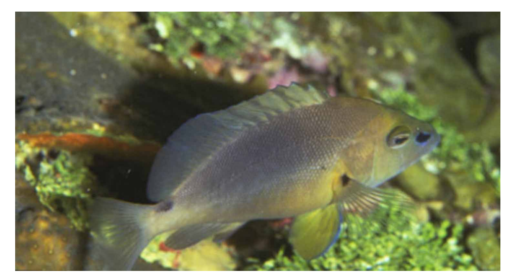
FIGURE 6. Hypoplectrus randallorum, Belize.

Other characteristics similar to congeners as described above.