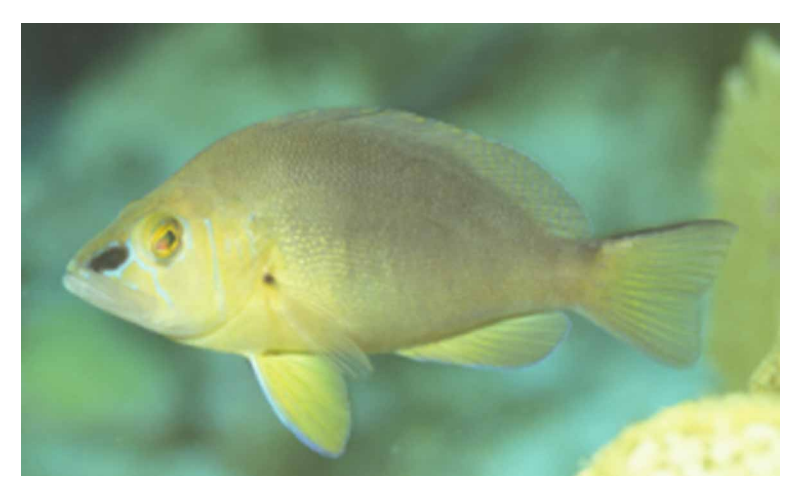
FIGURE 5. Hypoplectrus randallorum , paratype: MCZ 169203, 91.4 mm SL, Glovers Atoll, 10 m depth, ocean side reef, spear, 21 July 1999, P. S. Lobel and J. E. Randall.

caudal-peduncle depth 14.0 (13.6-14.2); caudal-peduncle length 11.8 (9.9-13.8); predorsal length 43.3 (42.4-46.4); preanal length 22.1 (16.8-26.9); prepelvic length 42.8 (40.7-44.9); base of dorsal fin 55.4 (49.8-57.7); longest dorsal spine 16.7 (16.1-17.3); base of anal fin 18.8 (16.5-20.7); longest anal spine 14.6 (13.9-15.6); longest anal ray 18.2 (15.3-20.4); caudal fin length 22.8 (21.4-25.9); pectoral fin length 32.1 (31.9-32.4); pelvic fin length 25.9 (22.4-28.6).