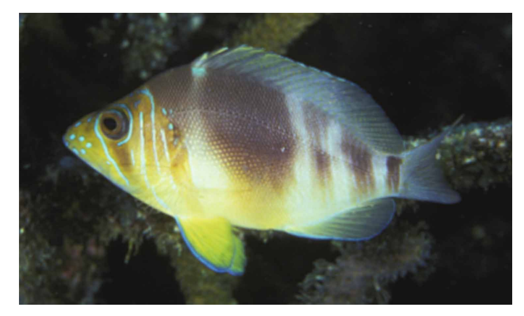
FIGURE 16. H. puella, Belize.