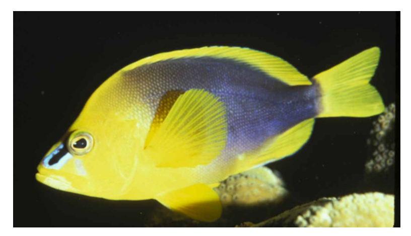
FIGURE 13. H. guttavarius, Jamaica.