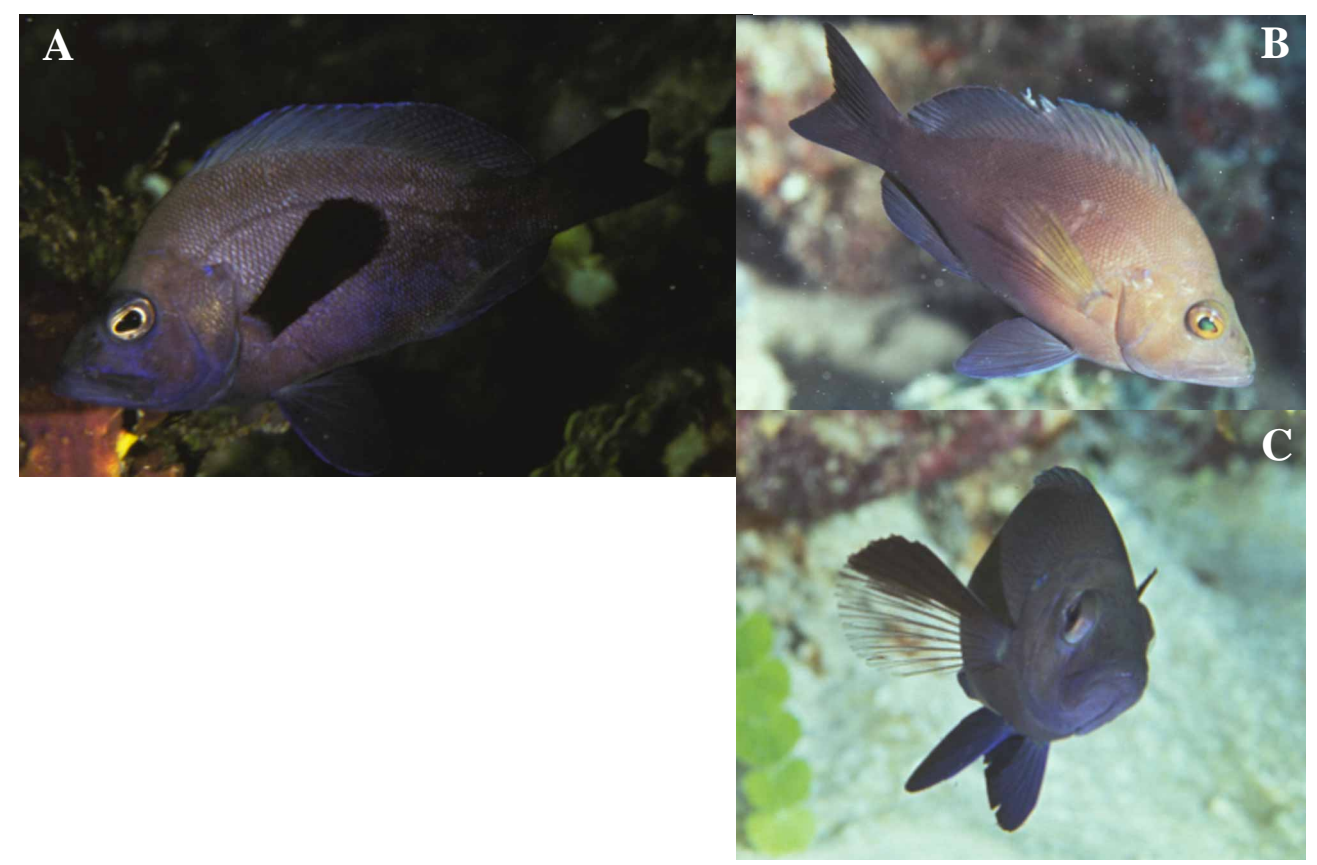
FIGURE 8. Color variations in H. nigricans . The notable difference is the coloration of the pectoral fin. A) Jamaica, B) Jamaica, C) Belize.