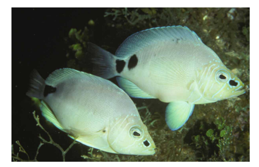
FIGURE 9. A mated pair showing the normal H. unicolor spot pattern on the caudal peduncle (lower right) and an individual with the double spot (upper). This was a mating pair, Discovery Bay, Jamaica.