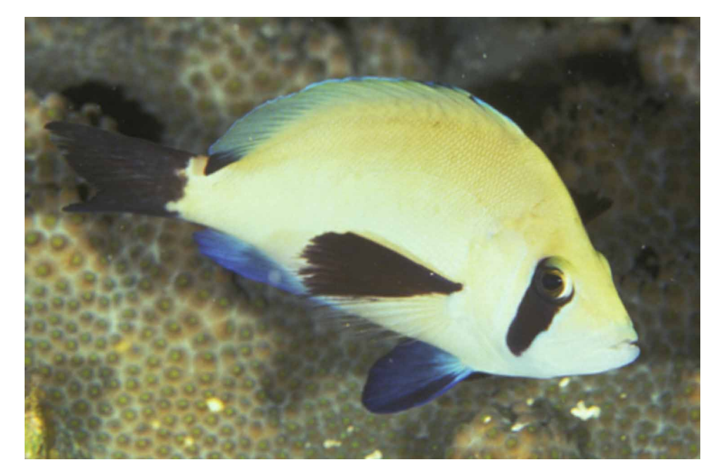
FIGURE 17. H. providencianus, Jamaica.