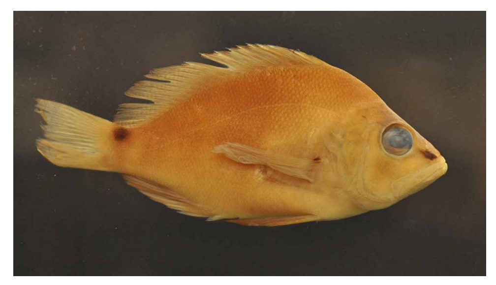
FIGURE 7. Hypoplectrus randallorum. Holotype MCZ 169250, preserved specimen.

spread in the western Caribbean from the West Indies to Central America (Heemstra et al. 2002, Aguilar-Perera & Gonzalez-Salas 2010, Holt et al. 2010). Although its body coloration can sometimes be dark, H. randallorum differs from the black hamlet by having nose spots. There are several variants of the black hamlet, H. nigricans that differ in the coloration of their fins and slightly in some body proportions (Aguilar-Perera 2004). Puebla et al. (2008) proposed, based on DNA data, that H. nigricans may actually represent several different lineages that have independently evolved from an ancestral H. puella stock during multiple evolutionary events. Three different color variants of H. nigricans that have been described by Aguilar-Perera (2004) are shown in Fig. 7.