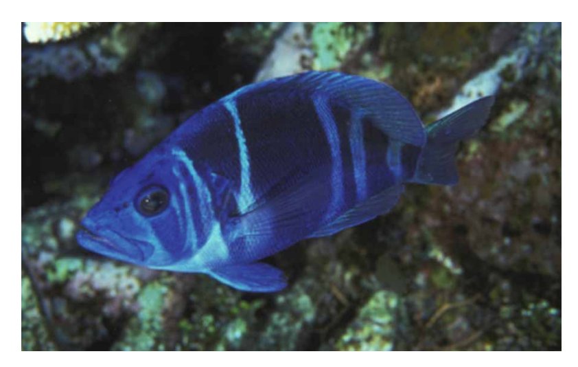
FIGURE 14. H. indigo, Belize.