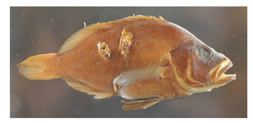
FIGURE 4. Hypoplectrus maya, holotype MCZ 169196, preserved specimen.