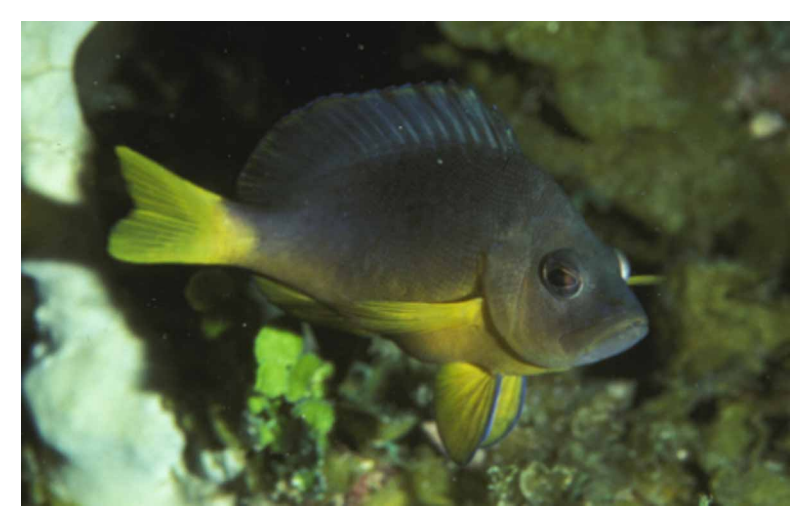
FIGURE 10. H. aberrans, Jamaica.

FIGURE 9. A mated pair showing the normal H. unicolor spot pattern on the caudal peduncle (lower right) and an individual with the double spot (upper). This was a mating pair, Discovery Bay, Jamaica.