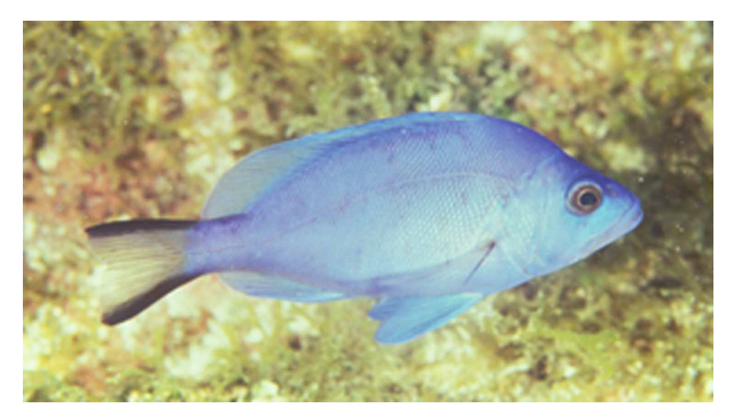
FIGURE 3. Hypoplectrus gemma, Conch Reef, Florida Keys.