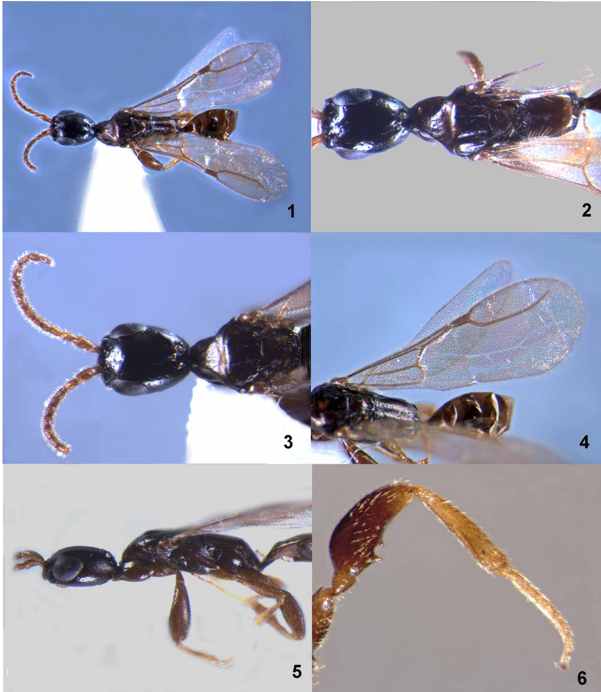
FIGURES 1–6. Foenobethylus hainanensis sp. nov. 1. Habitus, dorsal view. 2. Head and mesosoma, dorsal view. 3. Head, pronotum and mesoscutum, dorsal view. 4. Fore wing. 5. Head and mesosoma, lateral view. 6. Hind leg.

Median lobe of clypeus rounded. Antenna with 13 segments, flagellum with suberect and short pubescence. Ratio of length to width of antennal segments as follows: 10:4, 5:3, 5:3, 4:3, 4:3, 4:3, 4:3, 4:3, 4:3, 4:3, 5:3, 5:3, 5:3; scape incrassate apically. Compound eyes small and bare. Distance between posterior margin of compound eye and occipital carina 1.2 times the length of compound eye in dorsal view. Distance between occipital carina and posterior ocelli 1.6 times the length of maximum diameter of the latter. POL : OOL : OL: DAO=8 : 20 : 5 : 3. Terminal segment of maxillary palpus 2.5 times as long as wide.