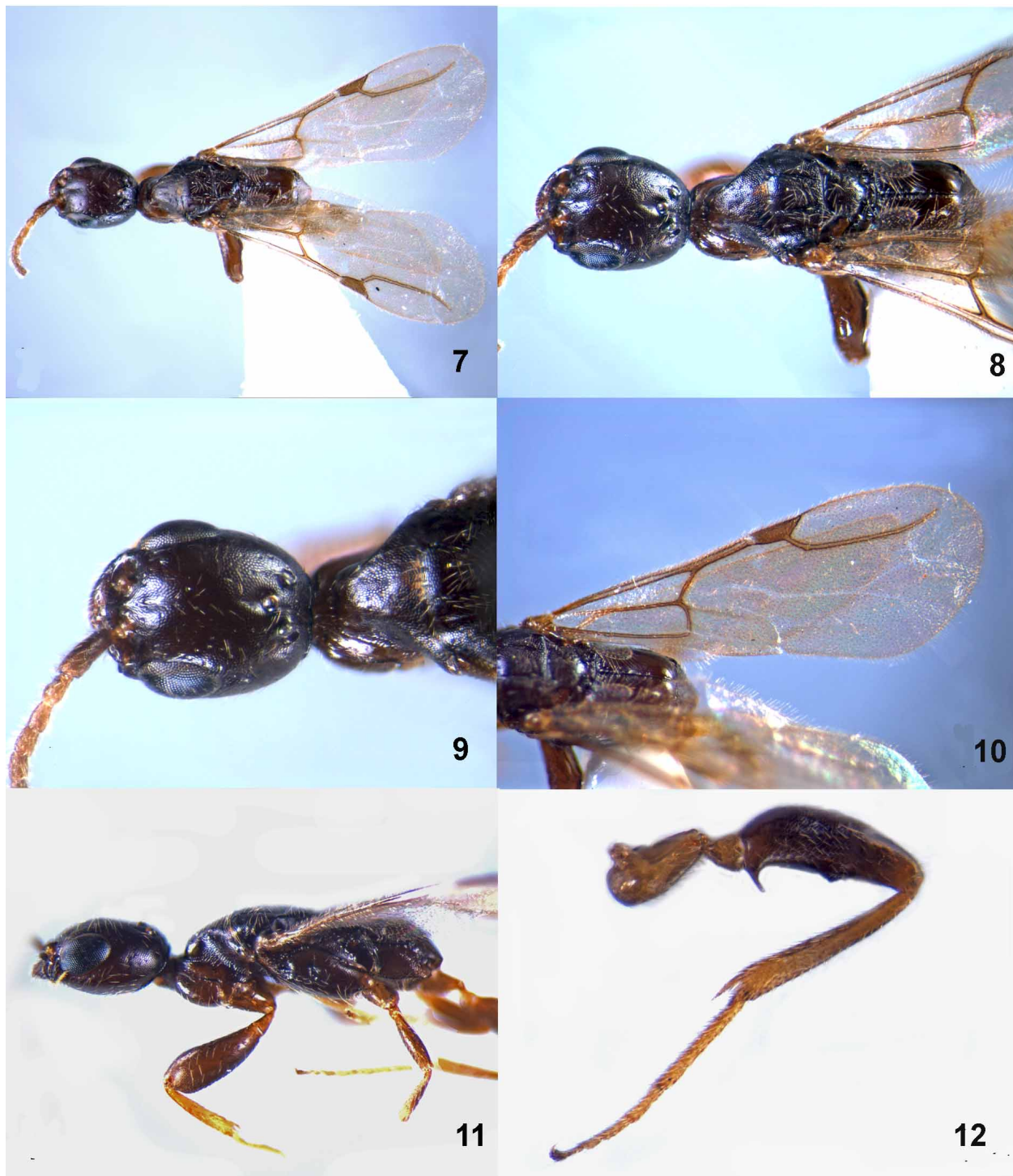
FIGURES 7–12. Foenobethylus zhejiangensis sp. nov. 7. Habitus, dorsal view. 8. Head and mesosoma, dorsal view. 9. Head and pronotum, dorsal view. 10. Fore wing. 11. Head and mesosoma, lateral view. 12. Hind leg.

Etymology. The specific name refers to the type locality.