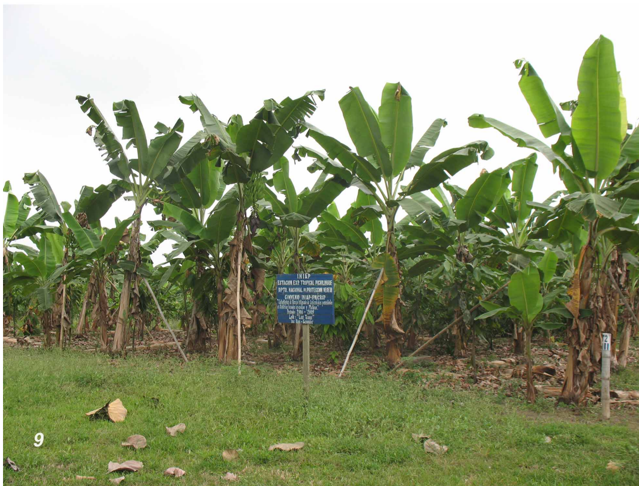
FIGURE 9. Type locality of Lepicerus pichilingue .