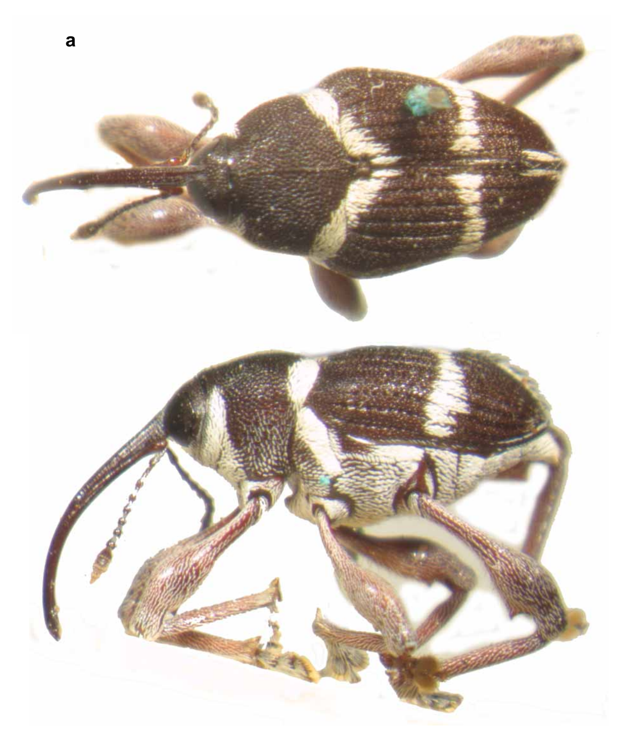
FIGURES 1. Curculio analis, male; (a) dorsal habitus; (b) lateral habitus. Scale = 1.0 mm in this and all subsequent figures.

Distribution: This species is only known from Malaysian Borneo: Sarawak, Sabah, Kuching, and Puak.