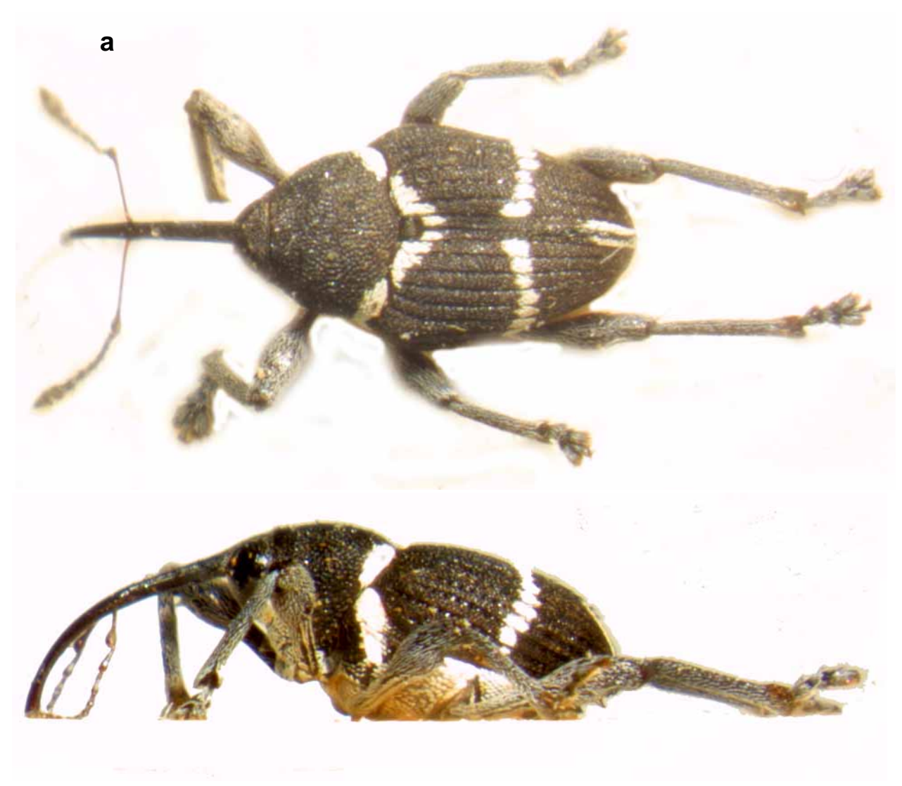
FIGURES 3. C. imitator , male; (a) dorsal habitus; (b) lateral habitus.

Type material: Lectotype 1 female (present designation): "Type / (BM red-rimmed type disc)" "Quop / W, Sarawak / G.E.Bryant / 21.iii.1914" and "G.Bryant Coll. / 1919-147" and "Balaninus / imitator Mshal. / TYPE female" and " Curculio imitator (Marshall) des. Pelsue 2009" (BMNH).