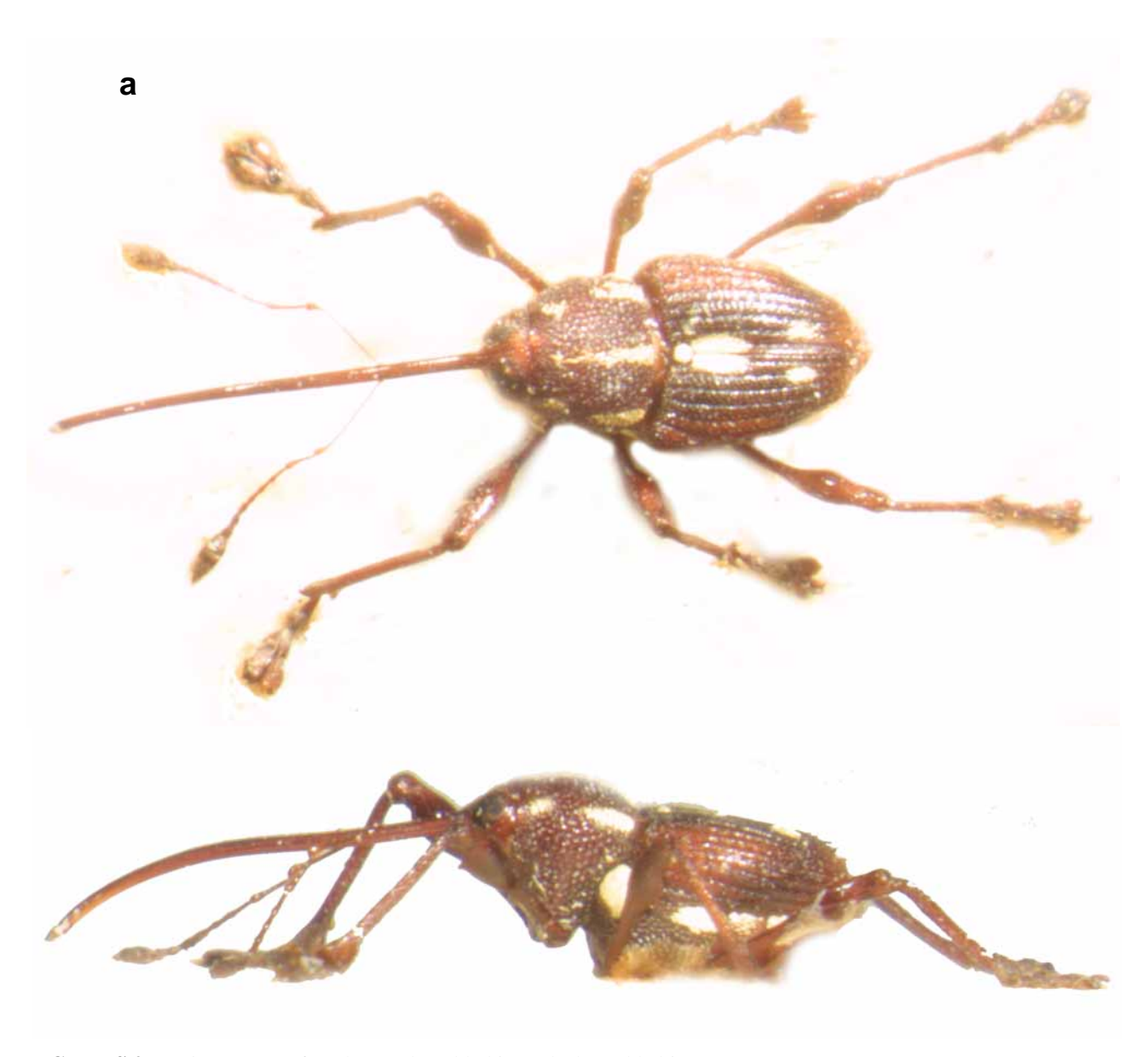
FIGURES 2. C. discreticoxi, female; (a) dorsal habitus; (b) lateral habitus.

Additional material examined: MALAYSIA: SABAH: male "Crocker Range / Mt. TrusMadi / 3-26-2001 / Coll. Native." (CWOB).