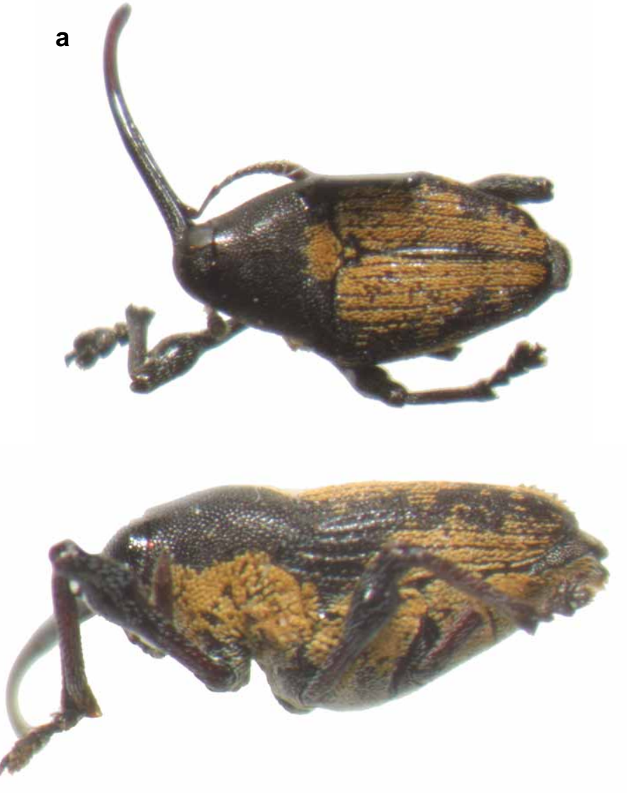
FIGURES 5. C. sellatus, male, neotype; (a) dorsal habitus; (b) lateral habitus.

Differential diagnosis: This species could be confused with Indocurculio nigromarginalis (Heller) proposed new comb. Pelsue (2009) with fulvus scales, but C. sellatus has a distinctly different rubiginose scale pattern on the dorsum of the thorax and a longer rostrum.