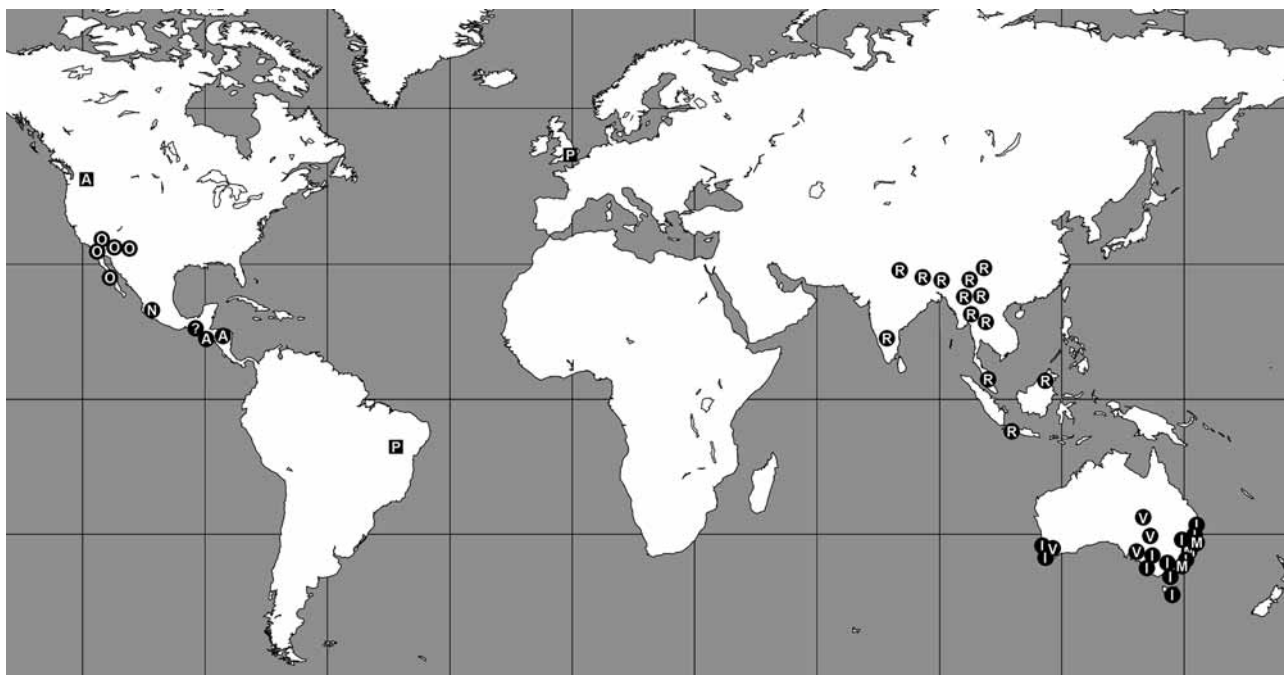
FIGURE 1. Distribution of extant and fossil Ithonidae. Circles indicate extant genera: A, Adamsiana ; O, Oliarces ; N, Narodona ; ?, unknown genus; R, Rapisma ; I, Ithone ; V, Varnia ; M, Megalithone ; squares indicate fossil genera: A, Allorapisma (Early Eocene); P, Principiala (Early Cretaceous).

Institutional abbreviations: SRIC, Stonerose Interpretive Center, Republic, Washington (U.S.A.).