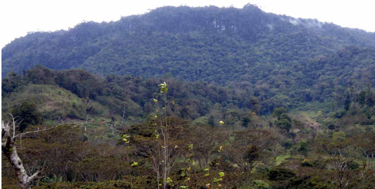
FIGURE 4. Montaña de Santa Bárbara, Depto. Santa Bárbara, Honduras, seen from the community of El Cedral, 1580 m elevation, in the vicinity of the type locality of Typhlops tycherus . The highest part of the mountain is >2700 m elevation.

Distribution. The single known specimen of Typhlops tycherus (Fig. 3) was found dead on the road at 1550 m elevation in the Zona de Amortiguamiento (buffer zone) of Parque Nacional Montaña de Santa Bárbara, between two small communities at the lower edge of the cloud forest in early February. This locality lies in the Lower Montane Wet Forest formation (Holdridge, 1967; McCranie & Wilson, 2002), where the habitat comprises agriculture and fragments of remnant cloud forest below about 1650 m elevation, and intact cloud forest extending above this point to the peak at approximately 2750 m elevation. There are three ecosystems found on Montaña de Santa Bárbara (House et al., 2002): Bosque tropical siempreverde latifoliado montano superior, cárstica (Karstic Upper Montane Evergreen Broadleaf Forest), Bosque tropical siempreverde latifoliado altimontano, cárstica (Karstic Altimontane Evergreen Broadleaf Forest), and, above 2000 m elevation, Bosque tropical siempreverde mixto altimontano, cárstica (Karstic Altimontane Evergreen Mixed Forest). These unique ecosystems exist only on Montaña de Santa Bárbara, and are characterized by having distinctive plant communities, including endemic species, on well drained karstic soils (House et al., 2002); the type locality of T. tycherus lies in the Karstic Upper Montane Evergreen Broadleaf Forest.