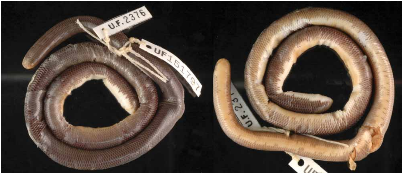
FIGURE 3. Dorsal and ventral aspects of the preserved holotype of Typhlops tycherus .

bital distance 4.2 mm, 66.7% of head width; parietals 2/2, anterior parietals cycloid, bordered posteriorly by second pair of wide, narrow occipitals; occipitals spanning about two dorsal scales; frontal contacted at posterior apex by two small scales that interrupt contact between occipitals; 4/4 supralabials, becoming large posteriorly; second and third supralabials contacting preocular; supralabial imbrication pattern T-III; preoculars about twice as high as wide, contacting anterior edge of eye spot; ocular about twice as high as wide at maximum; mental small, roughly equal in size to adjacent infralabials and chin scales; infralabials 4/4, roughly equivalent in size to each other and adjacent scales.