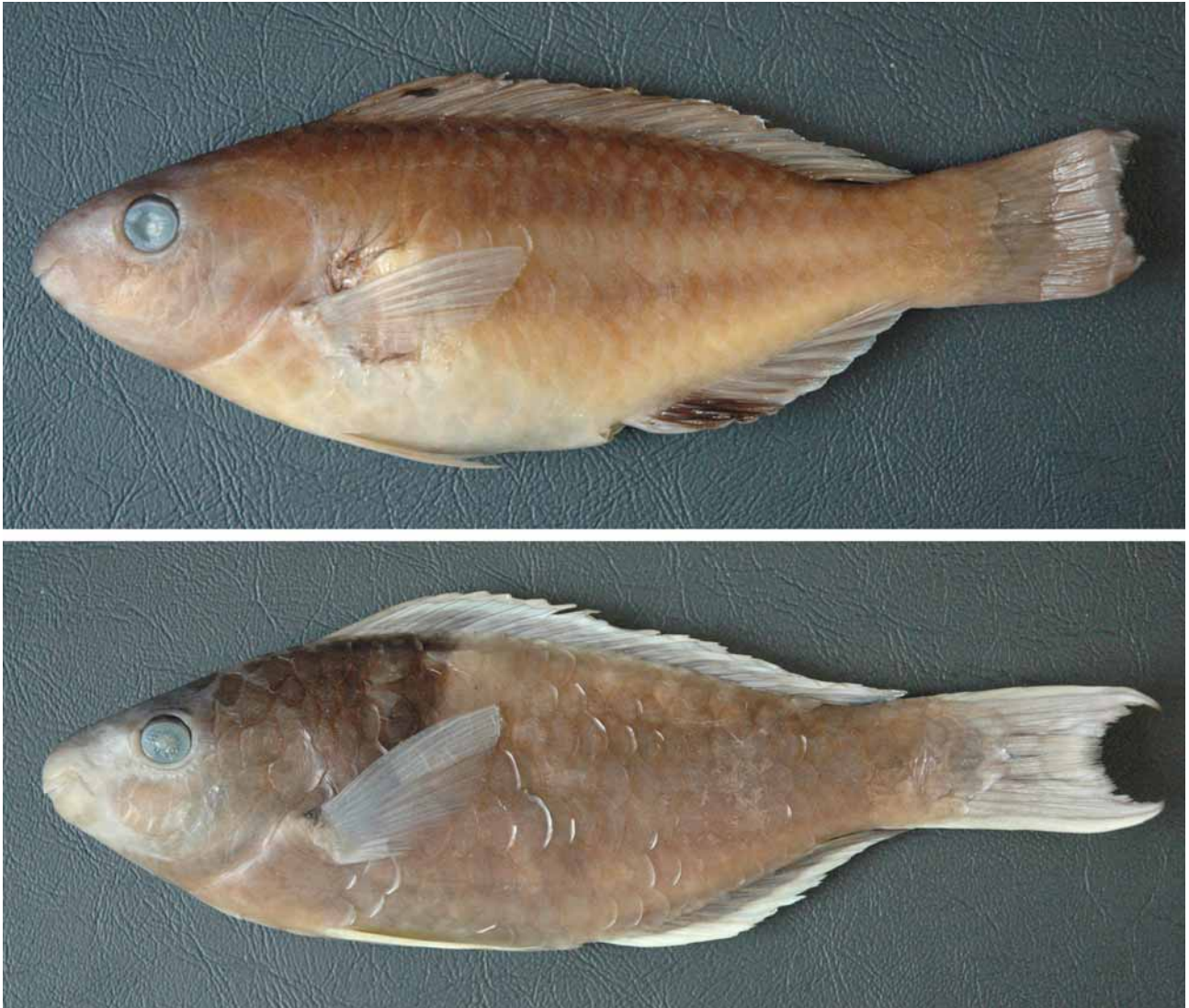
FIGURE 2. Specimens of Scarus maculipinna in alcohol. A. Holotype of Scarus maculipinna , PMBC 20408, initial phase coloration, 155.2 mm TL, Similan Island, Thailand. B. Paratype of Scarus maculipinna , FMNH 117285, 186.8 mm TL, terminal phase coloration (same specimen as Fig. 1B).

Nostrils small, the anterior in a short membranous tube, higher dorsoposteriorly, posterior nostril about 3 times larger than largest sensory pore of head, dorsoposterior to anterior nostril, the internarial distance about one-fourth orbit diameter. Scales large and cycloid; median predorsal scales extending to mid-interorbital space; dorsal fin with a low basal scaly sheath of a single row of small scales, one per membrane, diminishing in size posteriorly, and absent from about last 6 fin rays; no comparable scaly sheath on anal fin; caudal fin with 2 vertical rows of large scales on base, the middle pored scale of each row a little anterior to scales above and below, paired fins without basal scales.