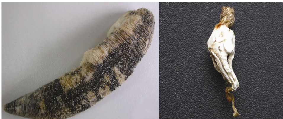
FIGURE 1. Phyllophorus (Phyllophorus) maculatus new species. Left, lateral view of Holotype, total length 80mm. Right, calcareous ring of a Paratype, length of ring 20 mm.

Diagnosis: Medium-sized, up to 80 mm long and 20 mm in diameter. Body cylindrical, posterior end more or less tapering. Tube feet small, scattered on body wall, more numerous ventrally. Tentacles 20 in three circles, 10+5+5. Calcareous ring with medium-length posterior projections on radials, each composed of about 10 small pieces. Ossicles in form of four-pillared tables with low spires, scarce in body wall, present only in posterior region near anus.