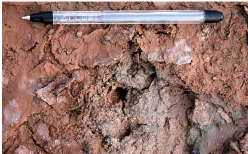
FIGURE 10. Cicindis adult burrow after removing a tiled-soil polygon.