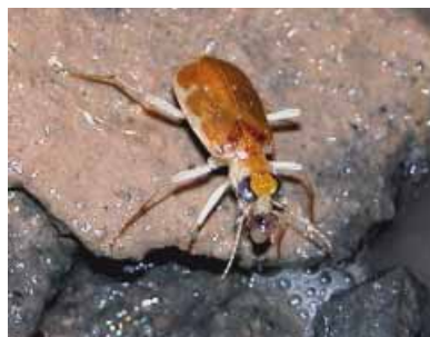
FIGURE 1. Adult Cicindis horni Bruch feeding on fairy shrimp.