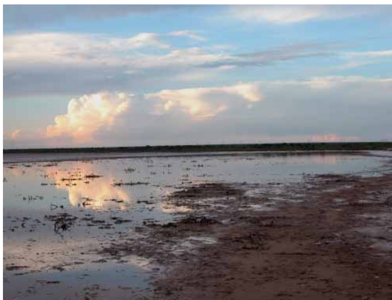
FIGURE 3. Vernal pool at margin of Salinas Grandes, Córdoba Province, Argentina at Km 895.5, National Highway 60 after the first of seasonal rains in January, 2004.