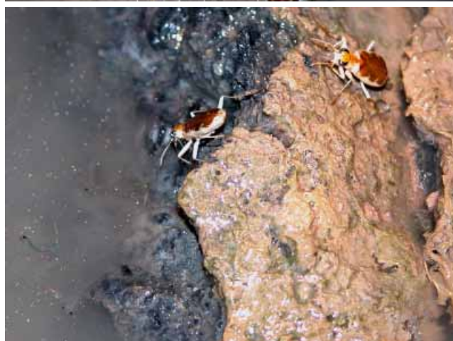
FIGURE 13. Adult Cicindis horni Bruch perching with slightly bioluminescent fairy shrimp nearby in water (lower left of image).