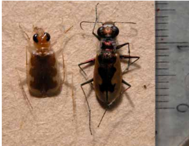
FIGURE 11. Adult Cicindis horni Bruch and Cicindela hirsutifrons Sumlin.