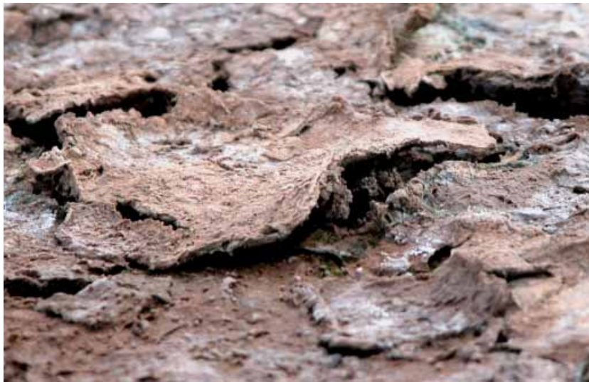
FIGURE 9. Tiled-soil polygon typical of some stretches of the shoreline surrounding Salinas Grandes.

pool surface of the total available of 15,000 square meters. Given the total size of the vernal pool, there were likely thousands of active individuals. At about this time, they also began flying to the UV light set up about 20 meters from the water's edge. The seven individuals we found at UV light were either on the sheet moving slowly or running erratically on the ground in front of the sheet. These beetles are slow fliers, although their take off from the water surface is rapid. We observed two types of flight patterns (see crepuscular activity above for one of these). When it was dark, after 2115 hrs, activity of the adults was mostly swimming, although many beetles that we tried to capture rose and flew well away above the water surface on which our net swept.