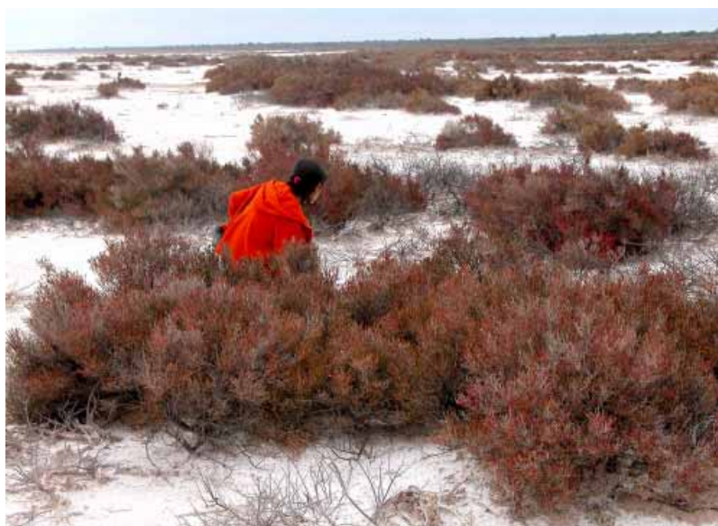
FIGURE 2. Margin of the Salinas Grandes, Córdoba Province, Argentina, at Km 895.5, National Highway 60 in October, 2003.