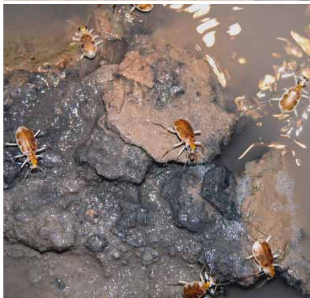
FIGURE 12. Adult Cicindis horni Bruch swarming, one individual swimming, two perching, two eating fairy shrimp, another standing.