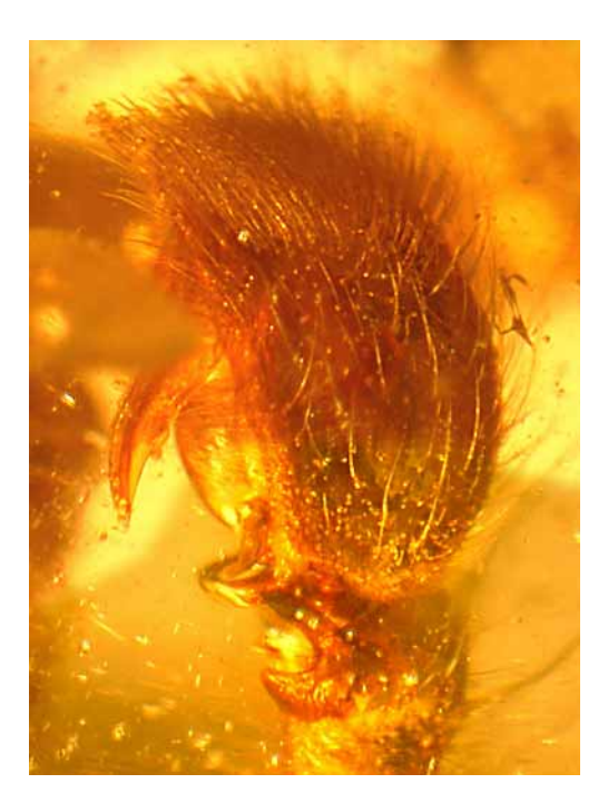
FIGURE 7. Garcorops jadis sp. nov., male holotype. 7, left male palp, rl view.