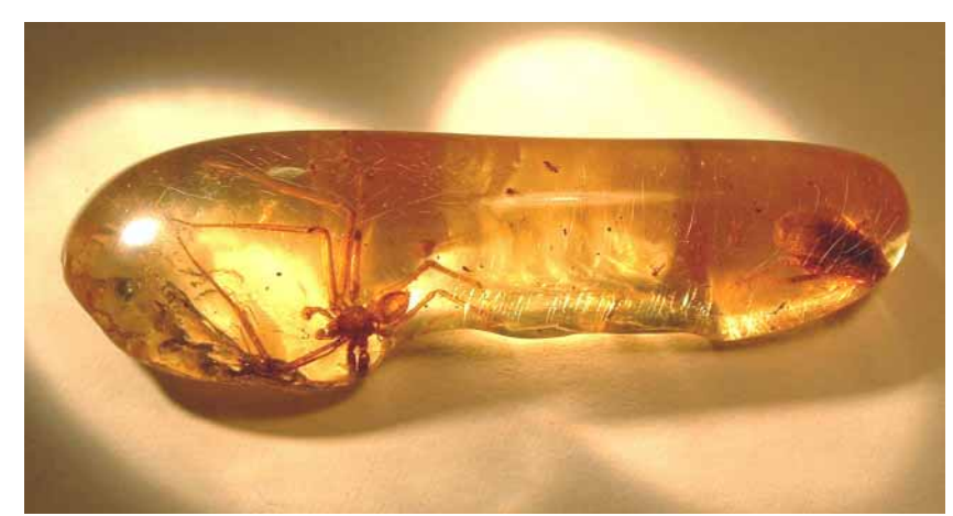
FIGURE 1. Garcorops jadis sp. nov., male holotype in Madagascar copal.