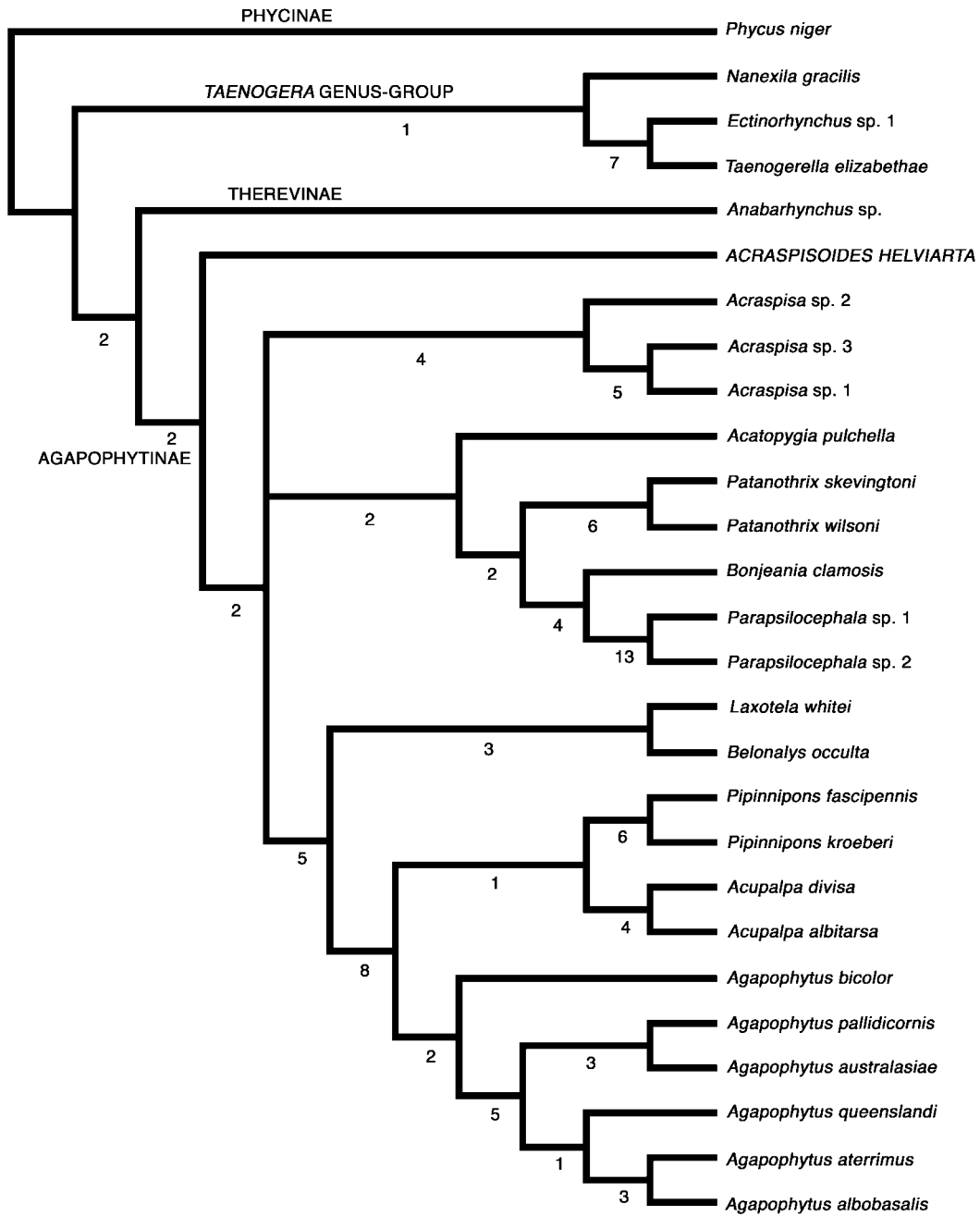
FIGURE 3. Phylogenetic relationships within the Agapophytinae. Strict consensus of two most parsimonious trees produced from analysis of expanded morphological and molecular dataset (length= 964; CI=0.46; R.I.=0.54). Numbers below branches represent Bremer support values.