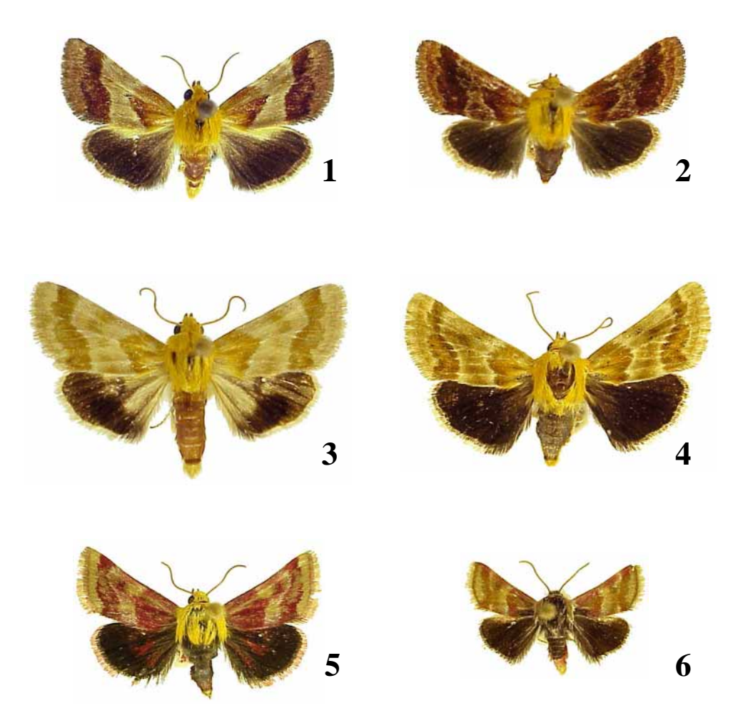
FIGURES 1–6. Adults. 1, Schina varix , Holotype male. 2, Schinia varix , paratype female, Texas, Hardin Co., RE Larsen Sandyland Preserve. 3, Schinia siren , male, Texas, Hardin Co., RE Larsen Sandyland Preserve. 4, Schinia siren , female, Texas, Briscoe Co., Caprock Canyon State Park. 5, Schinia roseitincta , male, Texas, El Paso Co., W. Montana Hwy. 6, Schinia antonio , male, Texas, McMullen Co., 18 mi N of Freer.

Description: MALE: Head: Front and vertex yellow orange, antenna and palpus yellow orange; ventral lip of frons slightly projected; eye large and globular. Thorax: Yellow orange, clothed dorsally with long hairlike scales; legs yellow orange; foretibia with one inner and one outer pair of heavy spines and a variable number of smaller spines dorsal to these; underside with shiny white flat scales and yellow-orange hairlike scales. Abdomen: Yellow orange, but slightly lighter than thorax; sternite 2 with lateral vestigial scent pockets. Forewing: Length 8.6–10.2 mm, average 9.6 mm (n = 12). Dorsally with extreme base clothed with long yellowish, hairlike scales, which partially obscure a small basal patch of lead-colored scales; basal third to antemedial line reddish purple (maroon); antemedial