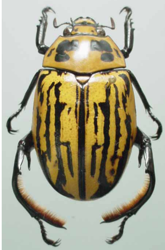
FIGURE 1. Promacropoides gloriagaitalis Curoe and Morón, sp. nov. Holotype.

Abdomen shorter than pterothorax (Fig.2). Posterior margins of sternites 2–4 deeply sinuate.