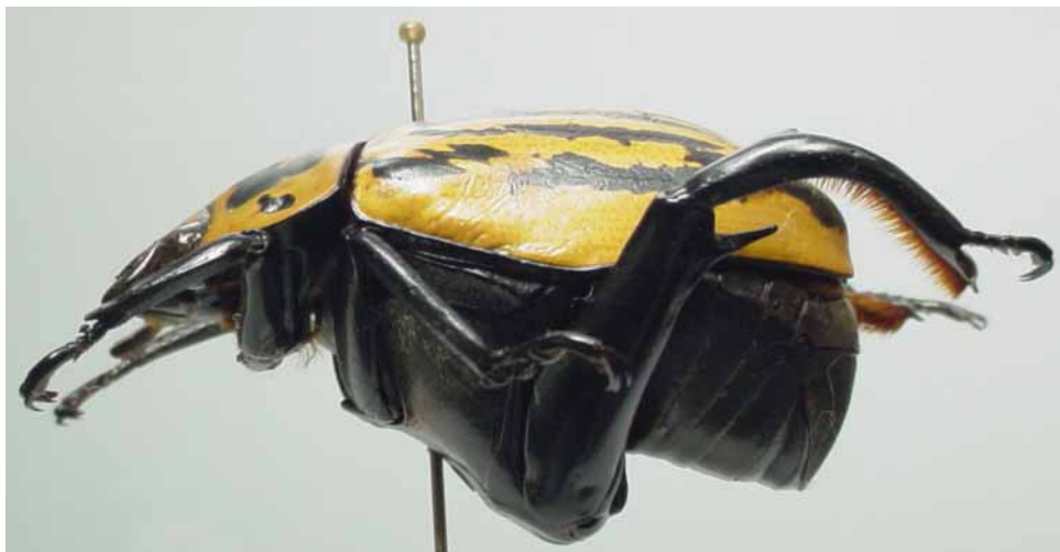
FIGURE 2. Promacropoides gloriagaitalis Curoe and Morón, sp. nov. Holotype. Lateral view.