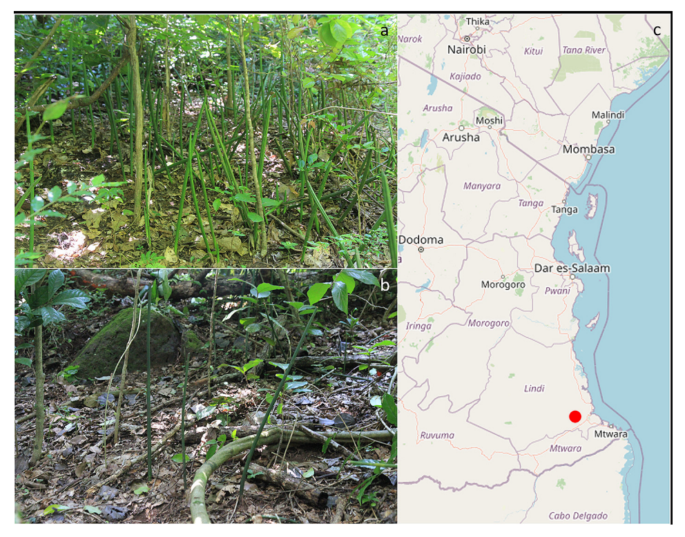
FIGURE 3. Habitat and map of occurrence. a: S. canaliculata in its natural habitat, Lindi Region. Note shiny green foliage and pungent leaf apices. b: S. pfennigii in its natural habitat, Lindi Region. c: Map of E Tanzania with the location of the S. pfennigii population studied (red dot). Photos U. Scharf, map from © OpenStreetMap contributors, download 4.1.2021 from openstreetmap.org, modified.