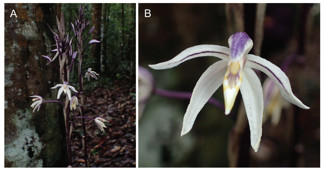
FIGURE 1. Aphyllorchis maliauensis (from the holotype). A. Flowering plant. B. Flower.

However, the original descriptions and subsequent literature clearly indicate that there is little morphological variation in A. montana sensu Reichenbach (1876), despite its extensive distribution, which includes Sri Lanka, Assam, southern India, the Philippines, Borneo, Thailand, Taiwan, Japan and Indonesia (Reichenbach 1886, Hooker 1890, Schlechter 1906, Ames 1908, Hayata 1911, Downie 1925, Fukuyama 1934, Roy et al. 2009, Aravindhan et al. 2013, Rao & Kumar 2015, Fig. 4). Because the morphological differences between A. maliauensis and A. montana are clear and stable, A. maliauensis should be treated as an independent species rather than as an infraspecific taxon of A. montana . Conducting additional surveys for A. maliauensis during the flowering season would reveal its precise distribution.