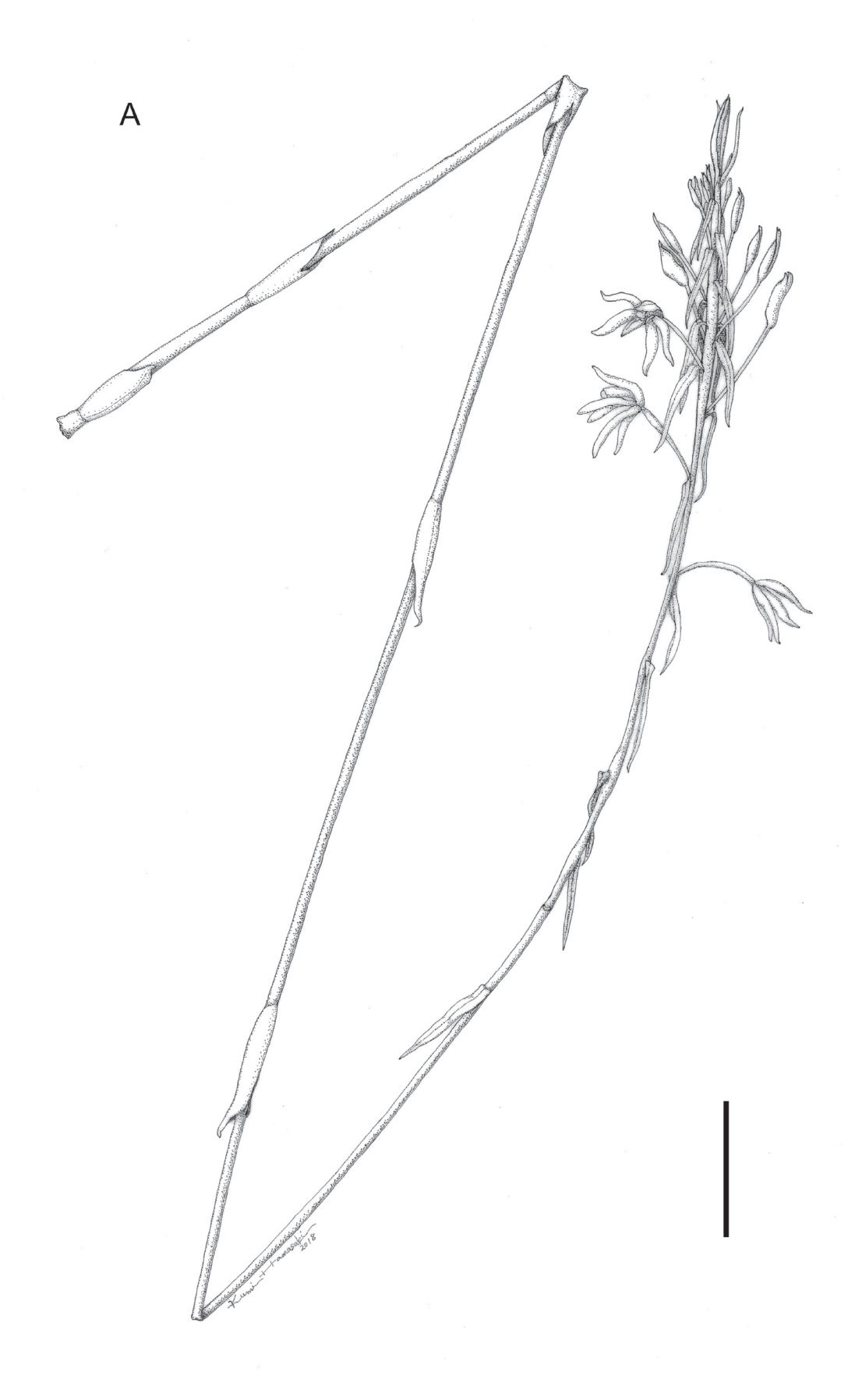
FIGURE 2. Aphyllorchis maliauensis (from the holotype). A. Flowering plant. Bar = 3cm. Drawings by Kumi Hamasaki.