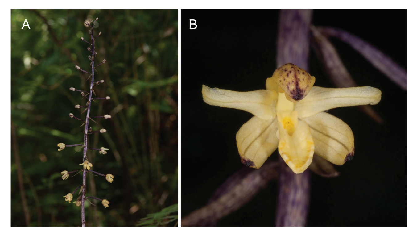
FIGURE 4. Aphyllorchis montana in Okinawa Prefecture, Japan on 25 August 2009 ( Obara KS217 , TNS). A. Flowering plant. B. Flower.