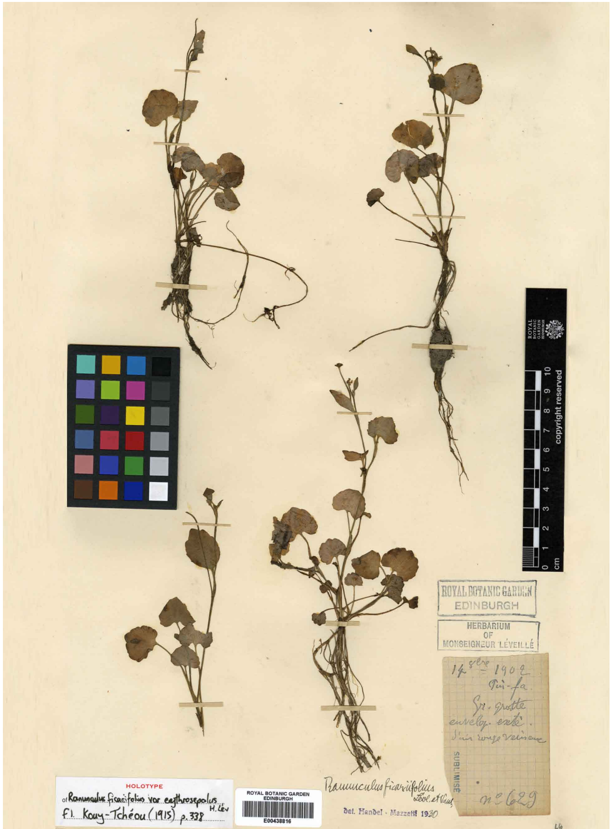
FIGURE 4. Lectotype sheet of Ranunculus ficariifolius .