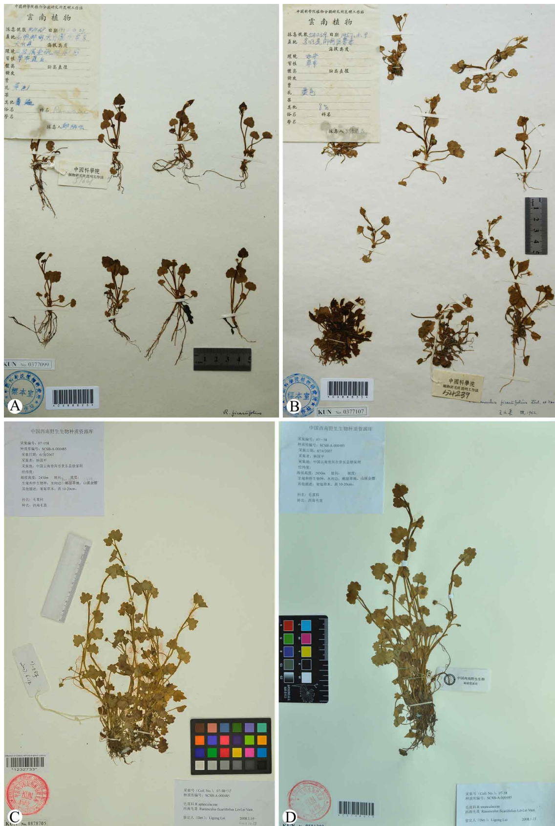
FIGURE 3. Specimens of Ranunculus ficariifolius . A. China, Yunnan, Songming, B.Y. Qiu 51668 (KUN). B. Same locality, B.Y. Qiu 54239 (KUN). C, D. China, Yunnan, Jingdong, G.P. Yang 07-58 (KUN).