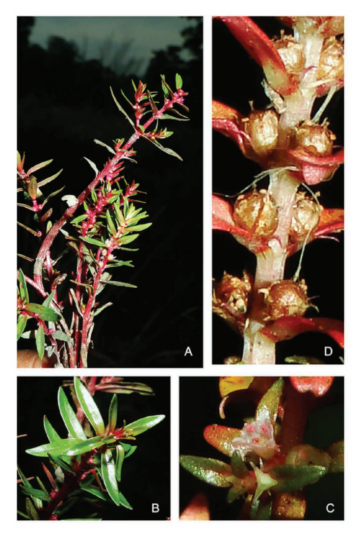
FIGURE 2. Rotala dhaneshiana A. Habit. B. A portion of twig. C. Single flower. D. A portion of twig with mature fruits.