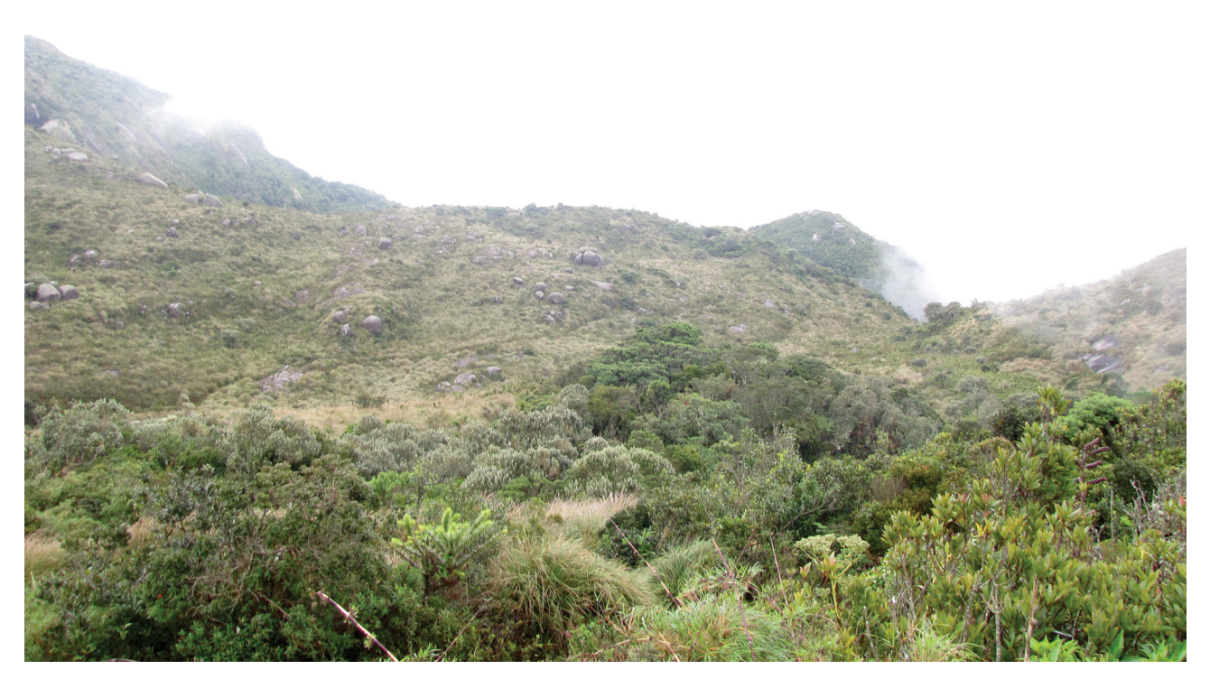
FIGURE 1 : The habitat of Dioscorea sphaeroidea in high-altitude grasslands of Serra dos Órgãos National Park, southeastern Brazil.

CUVC, CVRD, ESA, F, FCAB, FURB, GUA, HAL, HAS, HB, HCF, HRCB, HUCP, HUEFS, HUPG, HVASF, HXBH, IAC, ICN, INPA, IPA, IRBR, JE, JVR, K, L, LPS, M, MBM, MEXU, MG, MNHN, MO, MVFA, MVFQ, MVM, NY, P, PACA, PEL, PH, RB, RBR, RFA, RFFP, S, SMDB, SP, SSUC, U, UFP, ULS, UNR, UPCB, US, UV, WU, XAL, Z and ZT. The preliminary risk assessment was based on the IUCN Red List Categories and Criteria (IUCN 2001).