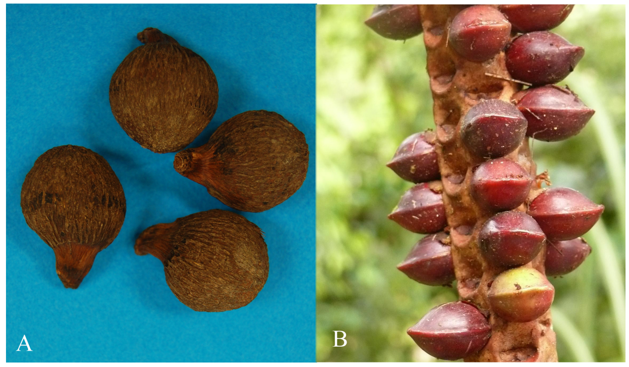
FIGURE 4. A. Fruits of Welfia alfredii showing the globose shape and contracted base, without dorsiventral compression and lateral ridges (from Graham 6031 ). B. Fruits of W. regia showing the almond shape and non-contracted base, with dorsiventral compression and lateral ridges (from Chocó, Colombia).

The most obvious difference between Welfia alfredii and W. regia is the shape of the fruits (Fig. 4). Only three of the specimens examined have mature fruits ( Graham 6031, Vásquez 35870, Valenzuela 19375 ). Label data from Rainer 11231188 describes fresh fruits as "globose, 4–5 cm diameter". Quantitatively, Welfia alfredii differs significantly from W. regia in five variables (lower leaf number, higher number of rachillae, greater rachillae width, higher stamen number, larger fruit diameter)( t –test, P <0.05). The new species is also geographically separate from W. regia , and the nearest populations of the two are more than 1,100 km apart and on opposite sides of the Andes. Habitat also differs, with W. regia occurring in lowland to montane rainforests at 295(0–1300) m elevation and W. alfredii occurring in montane forests at 1502(1391–1725) m elevation.