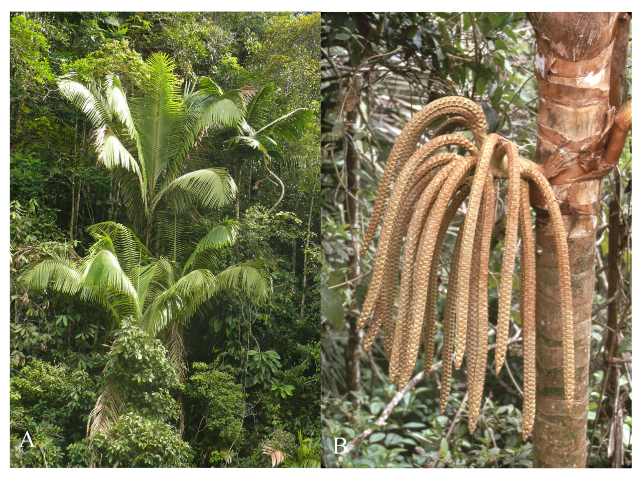
FIGURE 5. Welfia regia . A. Habit (image by G. Galeano from Chocó, Colombia). B. Inflorescence (image by A. Henderson from Antioquia, Colombia).