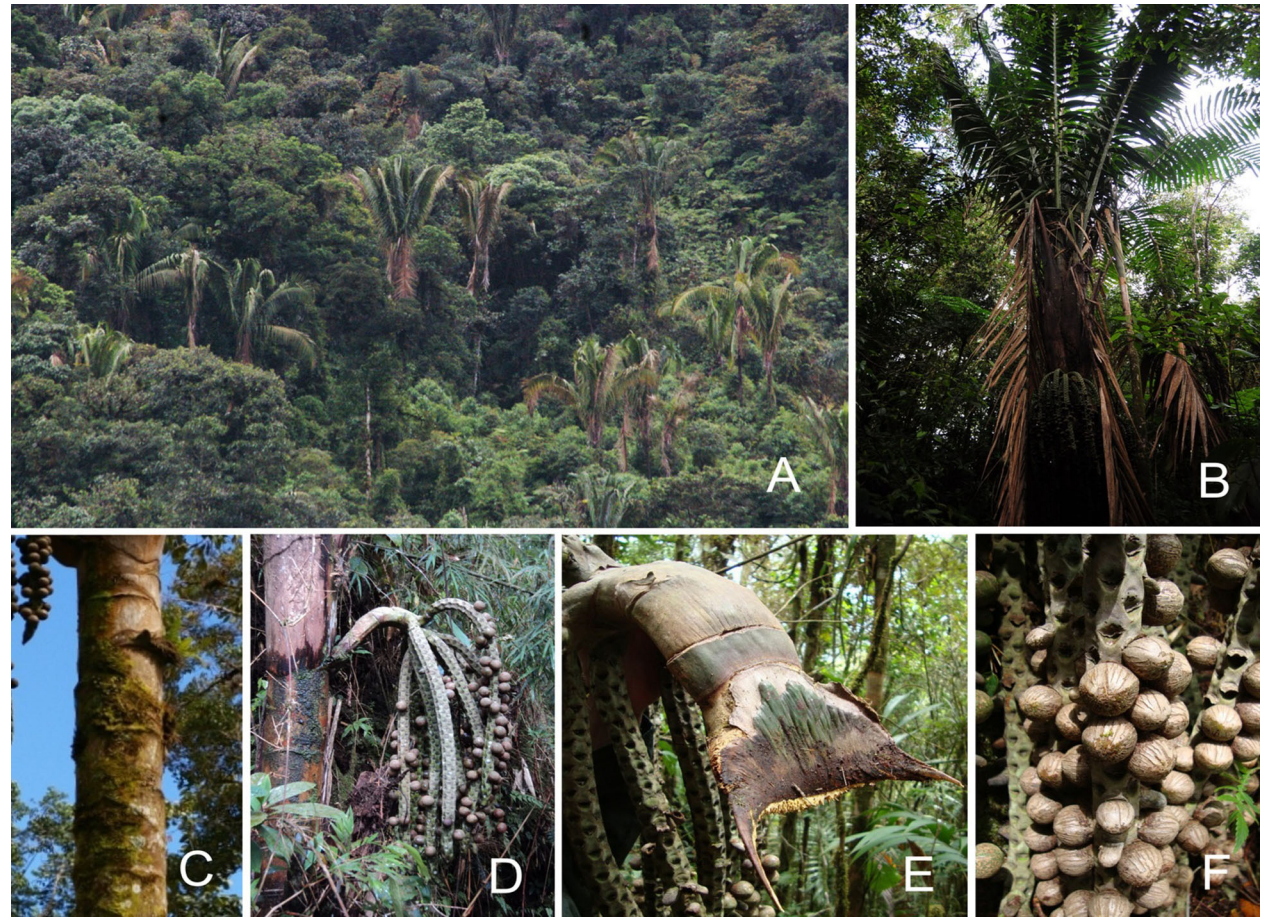
FIGURE 2. Welfia alfredii . A Habitat in montane forest at Bosque de Protección Pui–Pui. B. Habit. C. Stem with leaf scars. D. Infructescence. E. Peduncle. F. Fruits..

Plants 14.7(9.0–19.0) m tall. Stems 7.5(5.0–12.0) m tall, 17.7(14.0–20.0) cm in diameter. Leaves 8(7–9) per stem; sheaths 74.1(64.0–90.0) cm long; petioles 35.1(34.4–36.0) cm long; rachises 463.5(360.0–570.0) cm long; pinnae 76(65–85) per side of rachis. Inflorescences prophylls 83.0 cm long; peduncular bracts 65.0 cm long; peduncles 22.2(18.0–24.5) cm long; rachillae 12(8–16), 72.1(55.0–100.0) cm long, 25.4(19.4–28.1) mm diameter; stamens 45(44–46); fruits globose, not or scarcely dorsiventrally compressed, scarcely ridged laterally and blunt apically, with a contracted base, 34.3(33.1–35.9) mm long, 25.9(24.8–28.0) mm diameter.