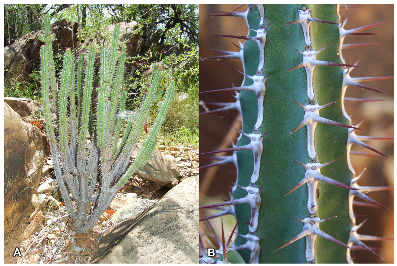
FIGURE 1. Euphorbia otjipembana subsp. okakoraensis: (A) plant in natural habitat, \pm 0.8 m tall; (B) branch indicating spine shields.

Phenology:--Cyathia were recorded on subsp. okakoraensis from August to October.