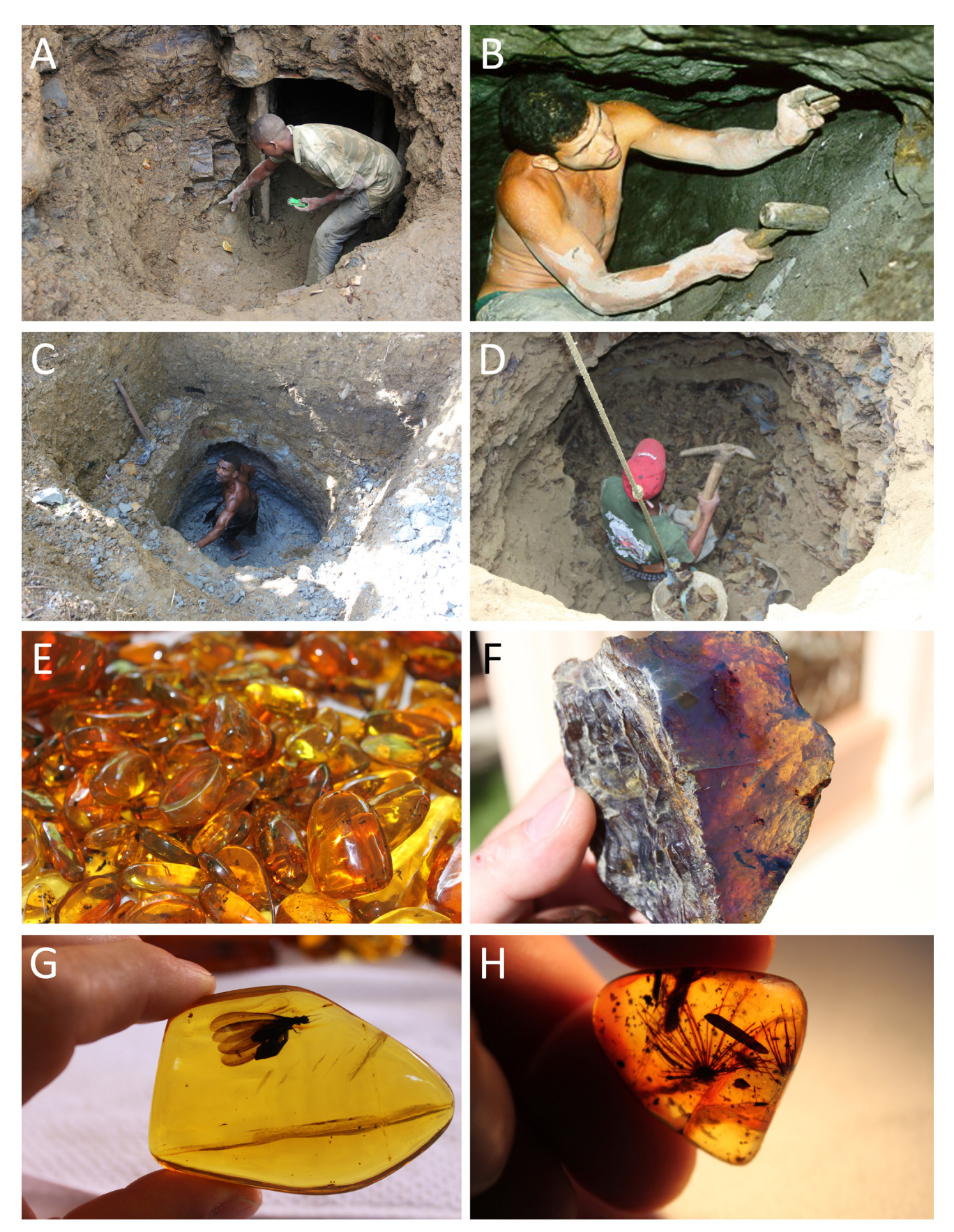
FIGURE 7. Dominican amber. A–D, Amber mining in hard conditions. E, Amber beads prepared for jewelry. F, Blue amber. G and H, Biological inclusions in Dominican amber.