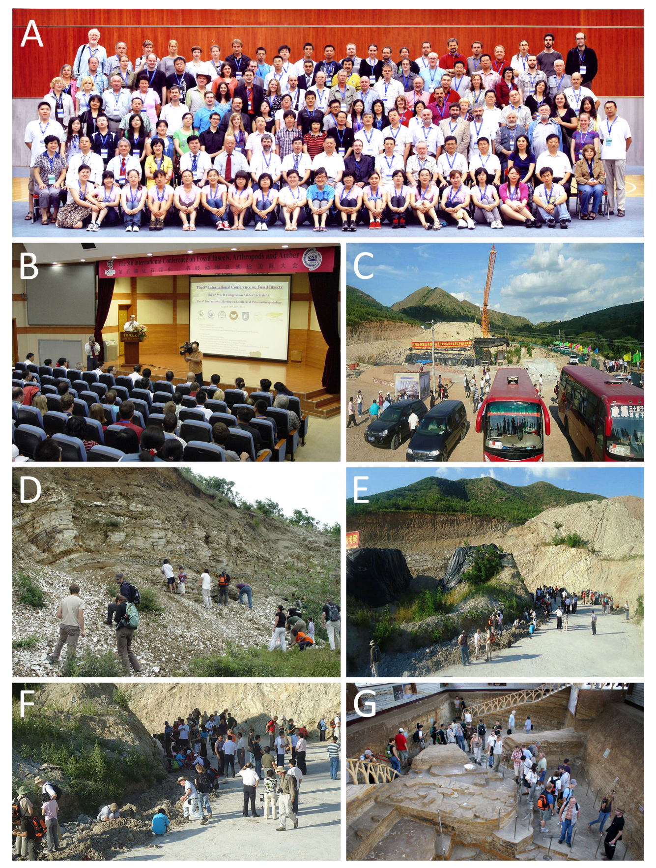
FIGURE 2. The 5<sup>th</sup> International Congress on Fossil Insects, Arthropods and Amber in Beijing (China, 2010). A , Group photo during the Congress. B , Address of the chairmen of the organizing committee Prof. Dong Ren. C–F, Field trip in Daohugou. G , Field trip in the locality of Jehol biota.