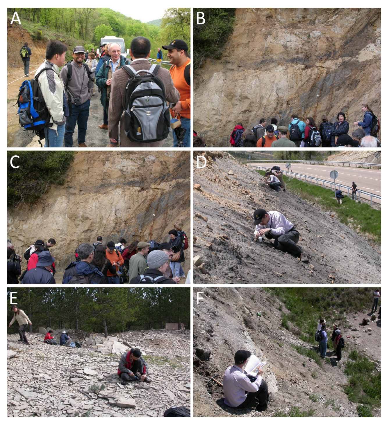
FIGURE 1. The 4<sup>th</sup> International Congress on Fossil Insects, Arthropods and Amber in Vitoria-Gasteiz (Basque region, Spain, 2007). A–C , Field trip in the Lower Cretaceous amber deposit in Peñacerrada II, Álava Province. D , Field trip in the Lower Cretaceous amber deposit in San Juan (Eastern Spain). E and F , Excursions during 4<sup>th</sup> International Congress on Fossil Insects, Arthropods and Amber in Spain.

was held in Edinburgh (Scotland) (Fig. 4), and included a field visit to the emblematic site of Rhynie with its famous Rhynie Chert. During this congress, "International Fossil Insects Day" was established, which now takes place on October 1<sup>st</sup> of every year. Several French postal stamps commemorating this day were created (Figs 5 and 6). In Edinburgh it was decided that the city of Santo Domingo in the Dominican Republic would be chosen to host the 8<sup>th</sup>