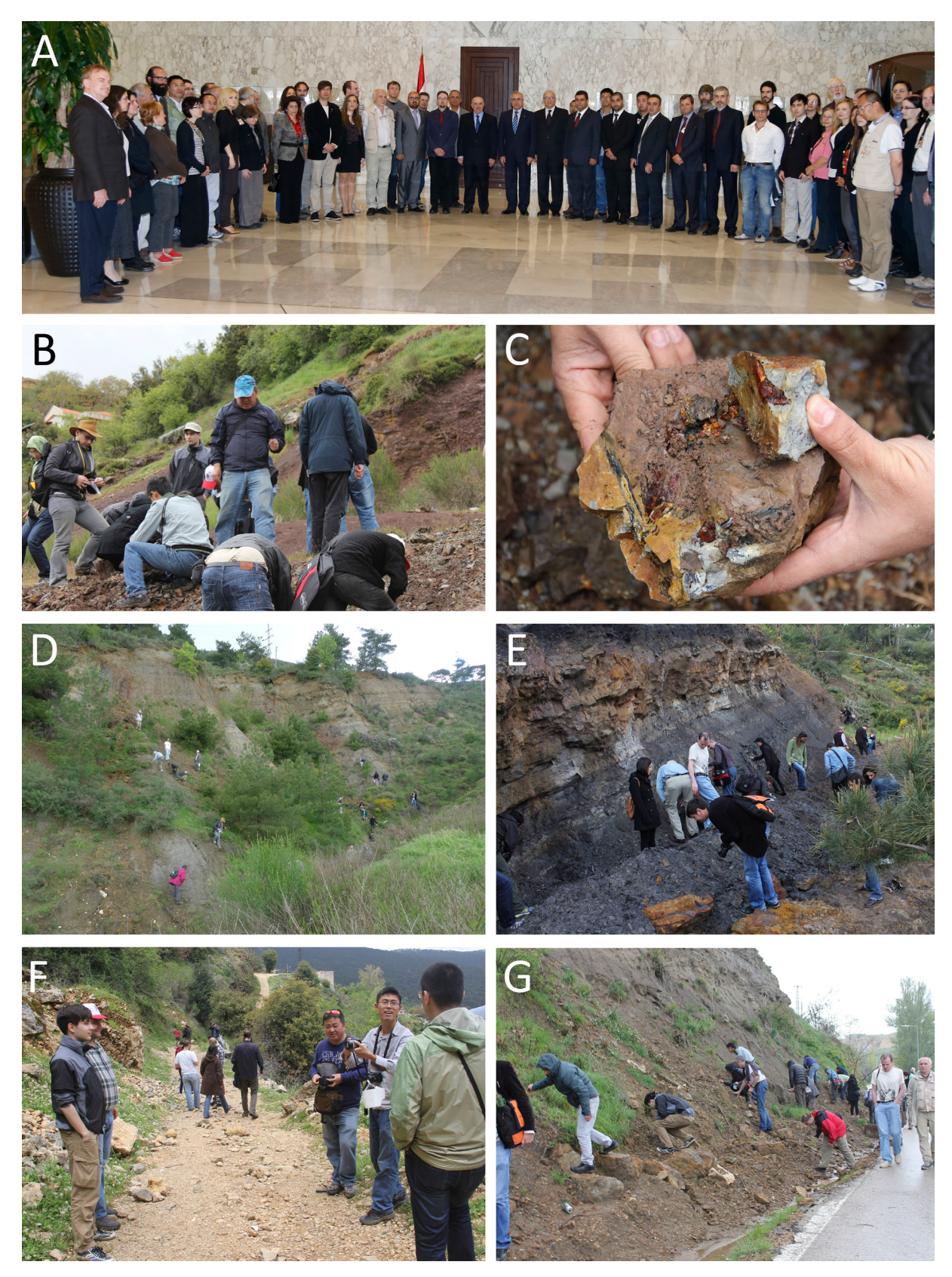
FIGURE 3. The 6<sup>th</sup> International Congress on Fossil Insects, Arthropods and Amber in Byblos (Lebanon, April 2013). A , Reception at the Lebanese Presidential Palace. B , Field trip in a Jurassic amber deposit in Aintourine (North of Lebanon). C , Jurassic amber from Aintourine (North of Lebanon). D , Field trip in a Lower Cretaceous amber deposit in Jouar Es-Souss, Bkassine (South of Lebanon). E , Field trip in a Lower Cretaceous amber deposit in Roum-Aazour-Homsiyyeh (South of Lebanon). F , Field trip in a Lower Cretaceous amber deposit in a Lower Cretaceous amber deposit in Hammana (Central Lebanon).