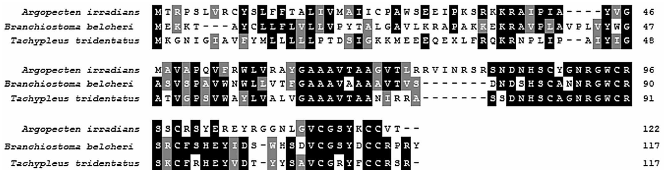
FIGURE 3. Multiple alignment of scallop Argopecten irradians (Lamarck, 1819)AiBD with big defensin from Tachypleus tridentatus (Leach, 1819) and defensin from Branchiostoma belcheri singtaunese (Gray, 1847) (Zhao et al. 2007). The black colour indicates positions where all three sequences share the same amino acid residue. Dashes indicate gaps inserted to improve the alignment.

nal defensin domain and a highly hydrophobic N-terminus. Its N-terminal region shows potent activity against gram-positive bacteria, while the C terminal defensin domain is more potent against gram-negative bacteria (Saito et al. 1995). In our laboratory, a mollusc counterpart of Big defensin (designated AiBD) was identified from the haemocyte cDNA library of the bay scallop Argopecten irradians (Lamarck, 1819). AiBD contained a typical signal peptide at the N-terminus, a transmembrane domain ranging from position 39 to position 58 and a defensin domain in the C-terminus. Multiple alignment of AiBD revealed that the hydrophobic region GAAAVT(A)AA at N-terminus and the consensus pattern C-X6-C-X3-C-X13(14)-C-X4-C-C in the defensin domain were highly reserved (Figure 3). The AiBD was a constitutive protein and the relative expression level of AiBD transcript was up-regulated evenly in the first 8 h, followed by a drastic increase, and increased 131.1-fold at 32 h after Vibrio anguillarum Bergeman, 1909 challenge (Figure 4). Biological activity assay with the recombinant protein showed its activity spectrum included both gram-positive and gram-negative bacteria, and also certain fungi (Zhao et al. 2007).