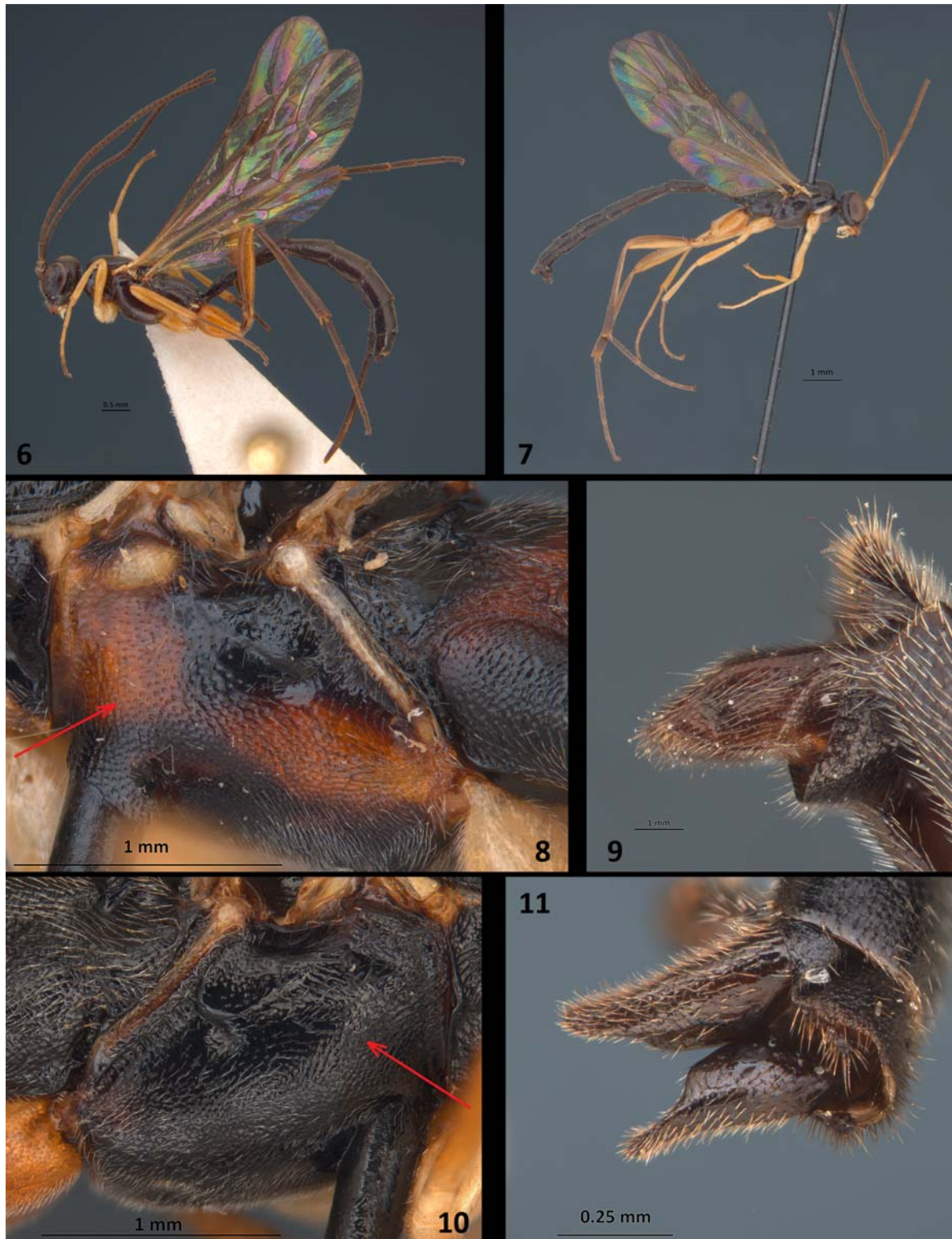
Figures 6–11. Poemenia spp. 6 , P. brachyura Holmgren, 1860, lateral view of female habitus; 7–9 , P. collaris (Haupt, 1917): 7 , lateral view of male habitus; 8 , lateral view of female mesopleuron; 9 , lateral view of male parameres; 10–11 , P. hectica (Gravenhorst, 1829): 10 , lateral view of female mesopleuron; 11 , lateral view of male parameres.

Pseudorhyssa is a Holarctic genus with 3 species, 2 of them occur in Europe (Yu et. al. 2012) and have been found in Carpathians.