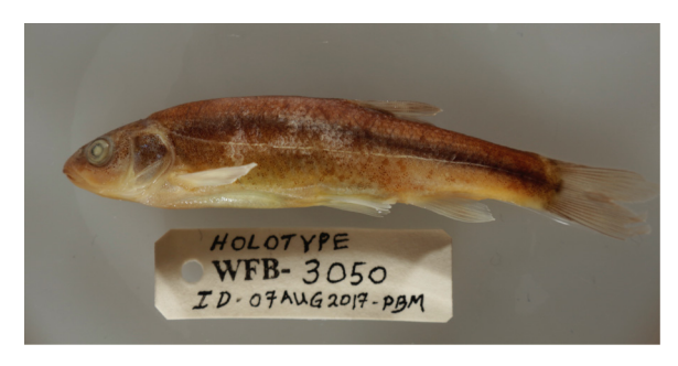
FIGURE 2. Holotype of Hesperoleucus symmetricus serpentinus, Red Hills Roach.

Etymology . Both the common and subspecies name reflect the nature of the rocks through which these small creeks flow. The Red Hills region is named for the color of the soils created by weathering one of the largest outcroppings of serpentine rocks in the Sierra Nevada. Serpentine soils are high in magnesium and other minerals and create conditions in which few species can live. The landscape has a sparse but highly endemic flora (Anacker & Harrison 2012, Harrison 2013) and streams are small and largely unshaded.