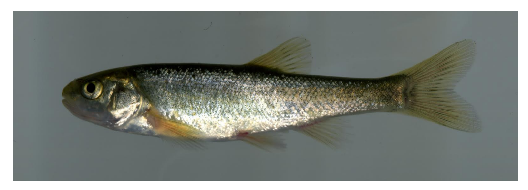
FIGURE 3. Hesperoleucus mitrulus, Northern Roach. Ana River, Lake Co., Oregon. September 27, 2010.

Description . Northern Roach are small (adult size typically 50–100 mm TL) bronzy cyprinids, similar in appearance to the California Roach (Moyle 2002; Fig. 3). They have a robust body, deep caudal peduncle, short snout and short rounded fins. Northern Roach differ from CA Roach in having short rounded fins and "cup-like" scales (Snyder 1913; Table 1). Snyder (1908) examined 20 fish from Drew Creek, Oregon and all individuals had 8 dorsal rays and 7 anal rays. Snyder found that males had longer, larger fins than did females, especially pectoral fins; the sexes could be differentiated by the ratio of pectoral fin length to body length.