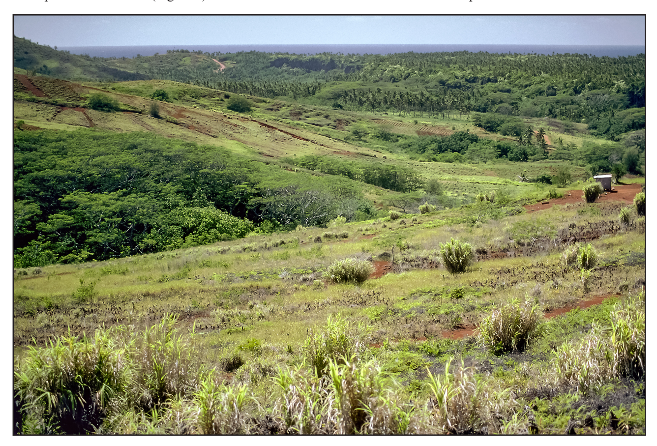
FIGURE 3 . Mangaia. A central open area with red volcanic soil is surrounded by swamps and wooded makatea limestone in the distance.

Mangaia:—The island is \sim 208 km south southeast of Rarotonga, with a land area of \sim 52 km² and a central hilly region of volcanic soil rising to \sim 170m elevation. It is the second largest and second highest of the Cook Islands. A ring of low-lying swamps surrounds the central region, and this in turn is surrounded by a dramatic ring of limestone makatea cliffs up to 75m elevation (Figure 3). The makatea zone is forested and contains deep chasms and caves.