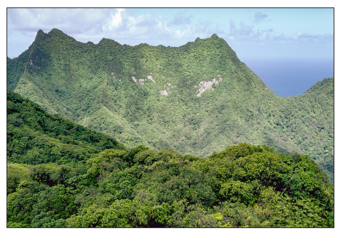
FIGURE 2. Rarotonga. Looking east from Te Kou at the cloud forest ridge from Te Manga (left) to Te Atukura (right).