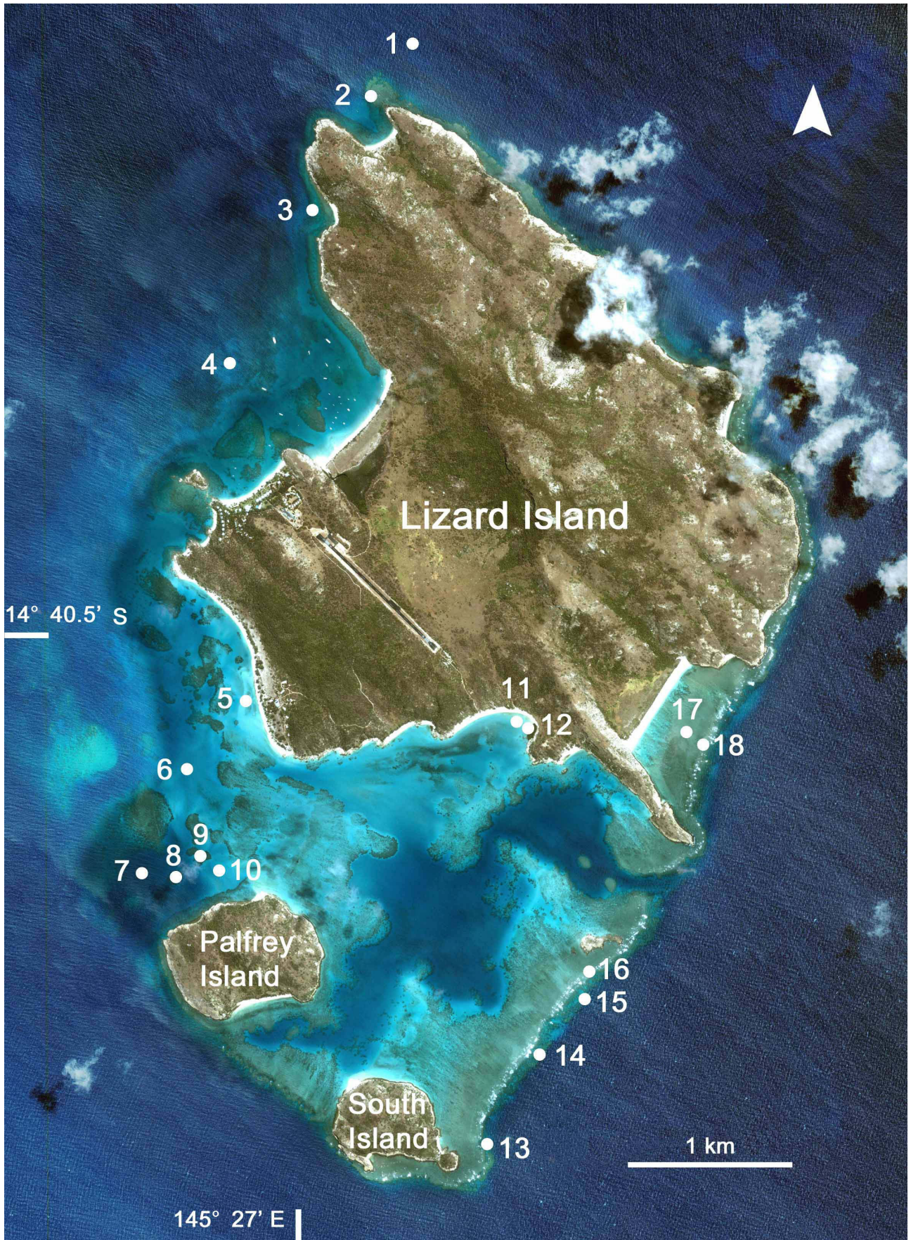
FIGURE 1. Lizard Island, aerial view showing collection sites 1–18, listed in Table 2.