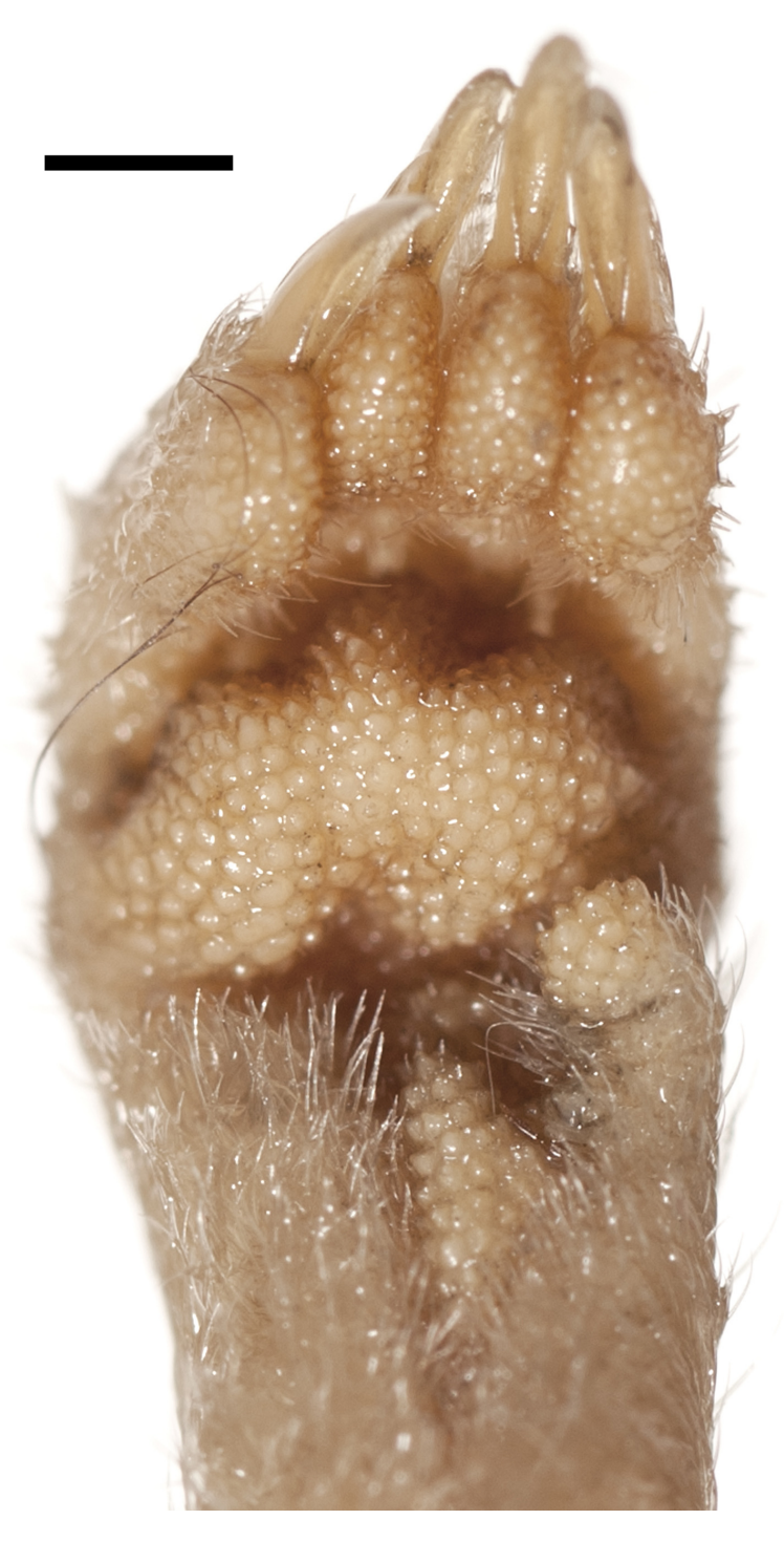
FIGURE 4. Plantar view of the right pes of the holotype of Sminthopsis granulipes , AM PA.669. Scale bar = approximately 1 mm.

name was likely to be Krefft, or possibly Ramsay. It remains unknown whether Troughton was aware that the name Podabrus albocaudatus had been published by Krefft in a newspaper article, rather than just representing a registration entry, but even if he was, he might not have regarded a newspaper article as valid publication given that a likely prevailing view was a requirement for publication in a scientific journal. The names of many new taxa first appeared in local newspapers, which were an important medium for disseminating scientific information in early colonial Australia, and often, but not always, appeared in articles that published abstracts from scientific meetings (Mahoney & Ride 1975). Although it is clear that at least some early authors such as Charles Walter De Vis in 1907 (see Ingram 1990) regarded newspaper articles as valid scientific publishing, the validity of names published in newspapers is determined by interpretation of the relevant articles of the current edition of the Code .