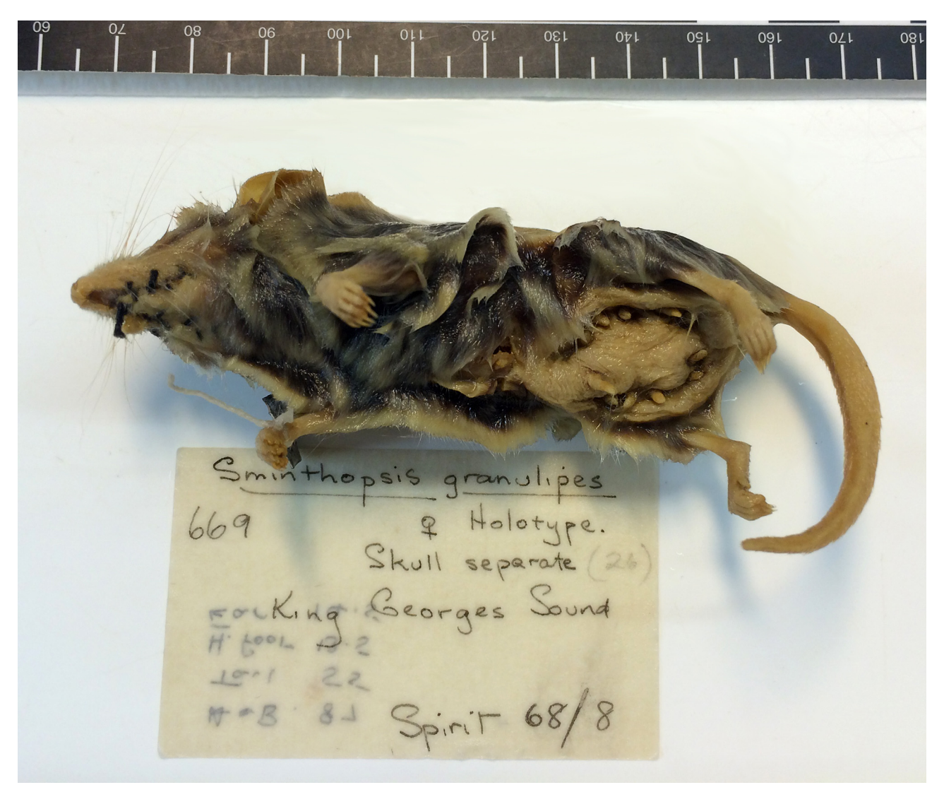
FIGURE 3. Holotype alcoholic body of Sminthopsis granulipes , PA.669, with metal registration tag attached to right manus. Scale rule in cms. (Photo: Anja Divljan).

published by at least 10 authors in the immediately preceding 50 years and encompassing a span of not less than 10 years" (Article 23.9.1.2). Accordingly, we declare Sminthopsis granulipes Troughton, 1932 as a nomen protectum , and Podabrus albocaudatus Krefft, 1872 as a nomen oblitum , in accordance with Article 23.9.1. and as required by Article 23.9.2. of the Code . The Principle of Priority is reversed to maintain prevailing use of the junior synonym granulipes Troughton, 1932 instead of Podabrus albocaudatus Krefft, 1872 which must not be used as a replacement name, because both conditions of Article 23.9.1. are met. First, albocaudatus Krefft, 1872 has not, to our knowledge, been used as a valid name after 1899, thereby fulfilling the condition of Article 23.9.1.1. Second, the condition of Article 23.9.1.2 also applies because granulipes Troughton, 1932 has been used as a valid name in at least 25 works by ten or more authors over the past 50 years. Article 23.9.1.2 applies. Accordingly, the Appendix lists 25 works published by more than ten authors over the past 50 years, all of which use S. granulipes Troughton, 1932 as a valid name.