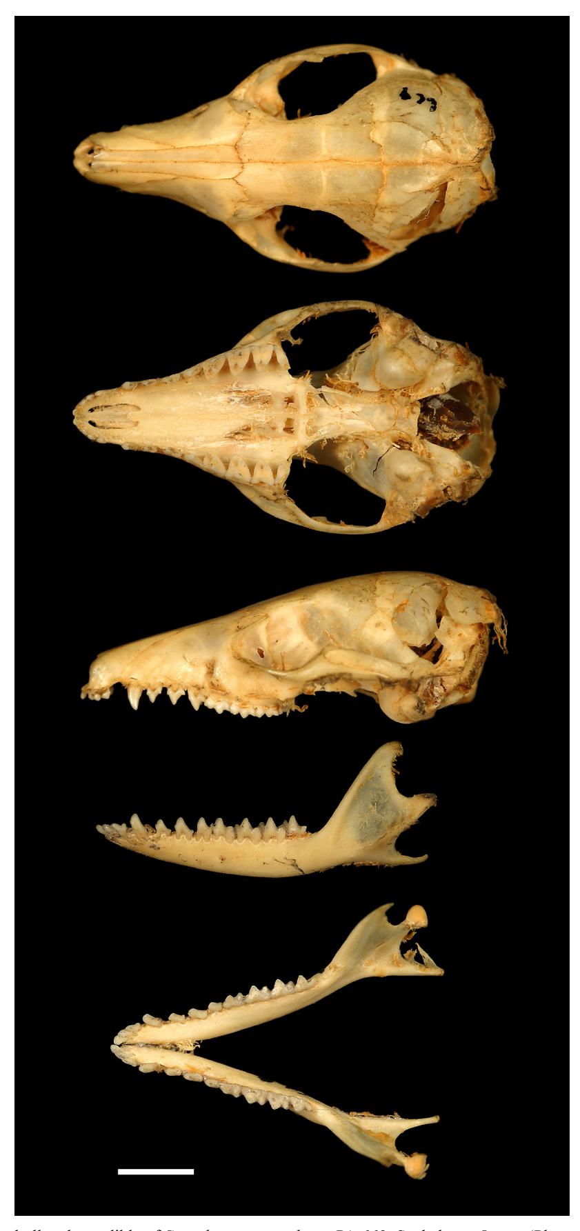
FIGURE 2. Holotype skull and mandible of Sminthopsis granulipes , PA.669. Scale bar = 5 mm..