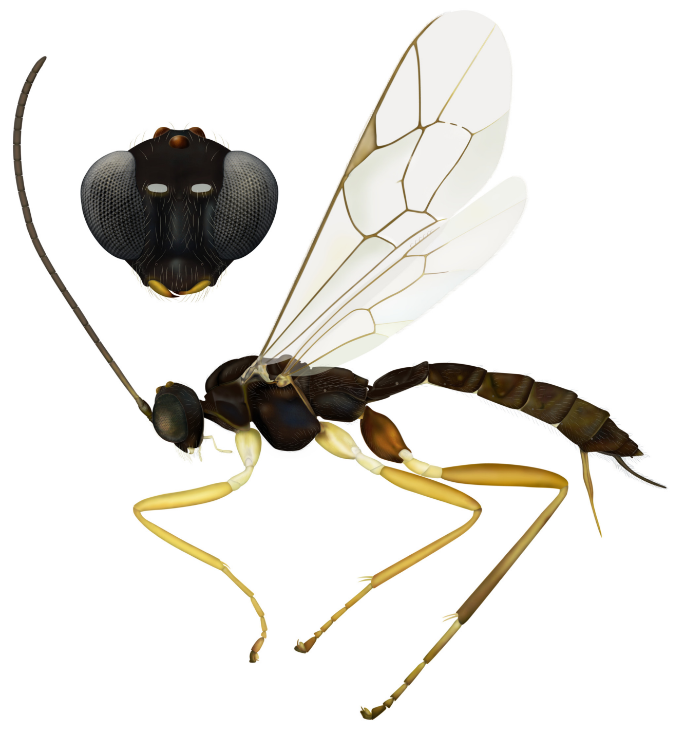
FIGURE 1. Flacopimpla barathrica sp. n.: Holotype in lateral view (slightly straightened) and head in anterior view.

Description . Holotype \mathcal{Q} , length of body 5.0 mm, of fore wing 4.2 mm.