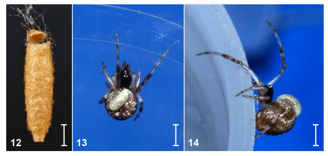
FIGURES 12–14. Holotype of Zatypota flamma sp. n.: 11—the cocoon and 12–13—the larva on its host Parasteatoda ?lunata. Scale bars 1 mm.

Mesosoma . Pronotum laterally glabrous, highly polished and smooth; mediodorsally with longitudinal crest (partly hidden by head and not properly seen); epomia more or less straight and continuing across pronotal collar. Mesoscutum glabrous, smooth and highly polished; notauli strongly impressed. Mesopleuron smooth and highly polished, ventrally and anteriodorsally with few setae; epicnemial carina extending dorsally beyond ventral corner of pronotum. Mesosternum pubescent. Metapleuron convex, evenly hirsute, polished, anterior part smooth, posterior part with weak rugosities. Propodeum polished, area spiracularis and area lateralis hirsute and weakly rugulose, elsewhere smooth and glabrous except for anterior part with some setae; D-shaped area petiolaris enclosed by strong carinae, lateromedian longitudinal carinae complete anteriorly of D-shaped area petiolaris but medially weak, lateral longitudinal carinae reaching forwards almost to spiracle; pleural carina moderately strong and complete. Fore wing with 2rs-m short, about as long as broad, radius distally slightly bent towards front edge of fore wing, base of 1m-cu separated from Cu1a at distance slightly less than length of Cu1b. Hind wing with distal abscissa of Cu1 entirely absent. Length of hind femur 4.2x its width. Hind tibia with inner surface without any trace of longitudinal furrow.