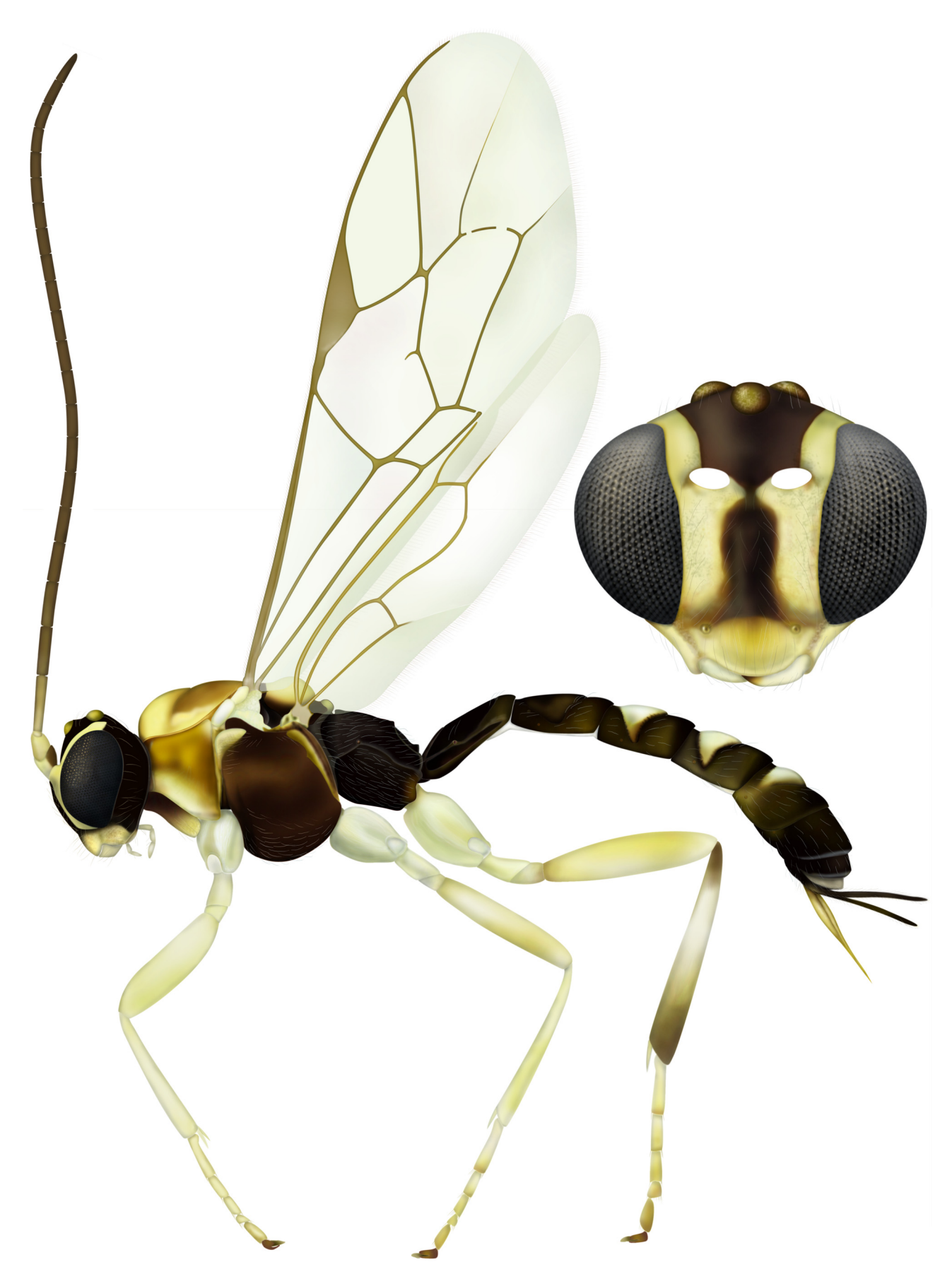
FIGURE 11. Zatypota flamma sp. n.: Holotype in lateral view (slightly straightened) and head in anterior view.