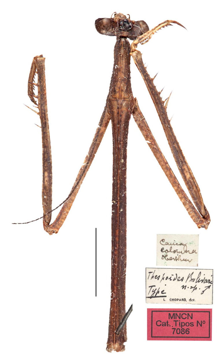
FIGURE 1. Male type of Thespoides bolivari Chopard, 1916 deposited at the MNCN, and its corresponding labels. Scale bar=5 mm.

C) The distal margin of the type specimen's pronotum contains a residue of glue, which provides additional (though circumstantial) evidence that, at one time, the anomalous posterior elements of the specimen were glued to the anterior elements.